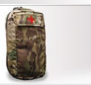
Dimensions: 8.5" H x 4.5" W x 2.5" D