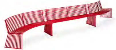
XBX15-4 (x2), XBC15-4