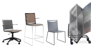
Splash pg 201