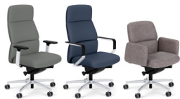
Vero pg 221