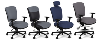
Brisbane HD 24/7