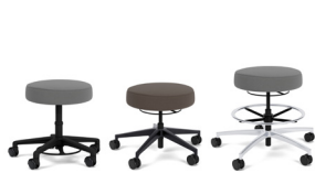
Spec Stools pg 195