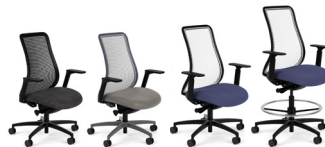
Genie Flex® 24/7