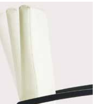
Optional flex-back available on guest and patient chair models