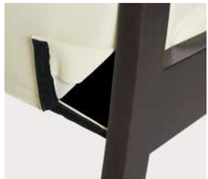
Seat and back upholstery covers are removable for easy cleaning or replacement