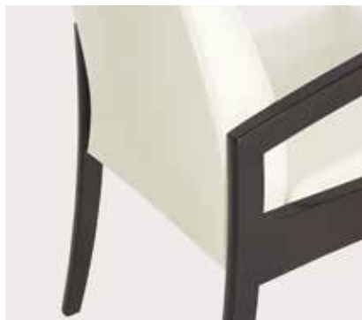
Wall saver rear leg design prevents damage to walls