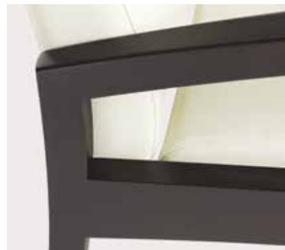
Ample spacing between seat and back enables easier cleaning