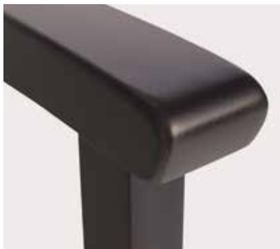
Extended arms feature contoured handgrips for easy ingress and egress