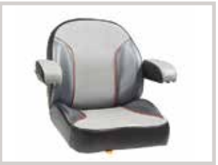
PREMIUM SEAT High quality adjustable seat features red trim with foldable padded armrests for added comfort. Optional on S125xt.