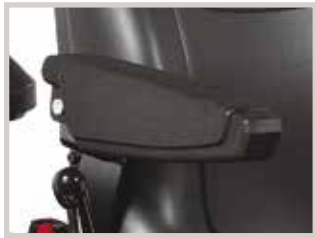
ARMRESTS Add these foldable armrests for increased riding comfort on S50xt.