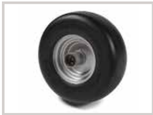
FLAT-FREE CASTER TIRES Run all day with no flats, eliminates downtime. Standard on walk-behind models.