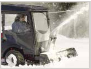
SNOWBLOWER/CAB Two-stage 60" snowblower and cab available on S800x.