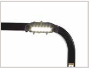
LED LIGHT KIT Energy efficient LED light kit with simple installation.