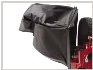
GRASS CATCHER A lightweight durable 3.75 bushel, fabric bag with hard plastic bottom attaches quickly.