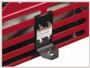
TRAILER HITCH KIT Will accept a 1/2" shank ball and comes complete with hardware.