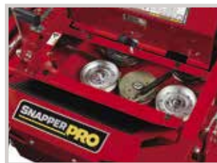
Quick removal of the floor pan provides convenient access to the top of the deck for easy cleaning and service.