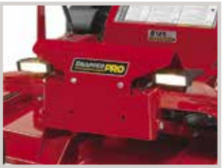
LIGHT KIT Select zero-turn models are pre-wired for simple installation.