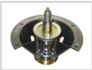
Cast-iron greaseable spindles maximize usable life. (52" model)