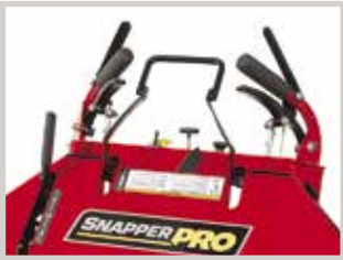
Reliably set your speed with the improved easy-to-reach cruise control bar featuring a speed indicator. Conveniently located brake handle.