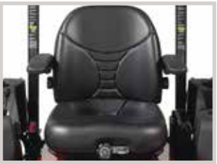
SUSPENSION SEAT Suspension seat for optimal comfort available on S800x, S200xt, and S150xt.