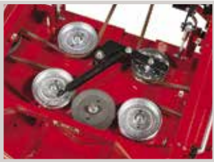
Deck drive belt system is designed to provide even belt tension which improves the life of the belt and reduces maintenance.