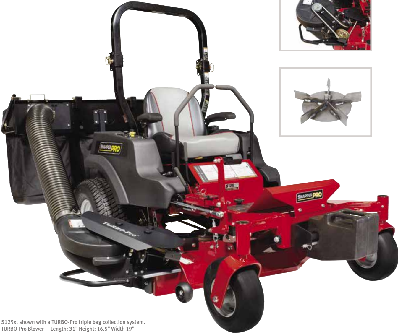
S125xt shown with a TURBO-Pro triple bag collection system. TURBO-Pro Blower — Length: 31" Height: 16.5" Width 19"