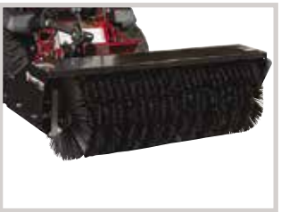
60" BROOM Clear debris and snow right down to the pavement. Bidirectional operation can be changed from the seat. (Optional cab available)