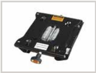
SUSPENSION SEAT INSERT Add this to the premium seat on the S800x for increased comfort.