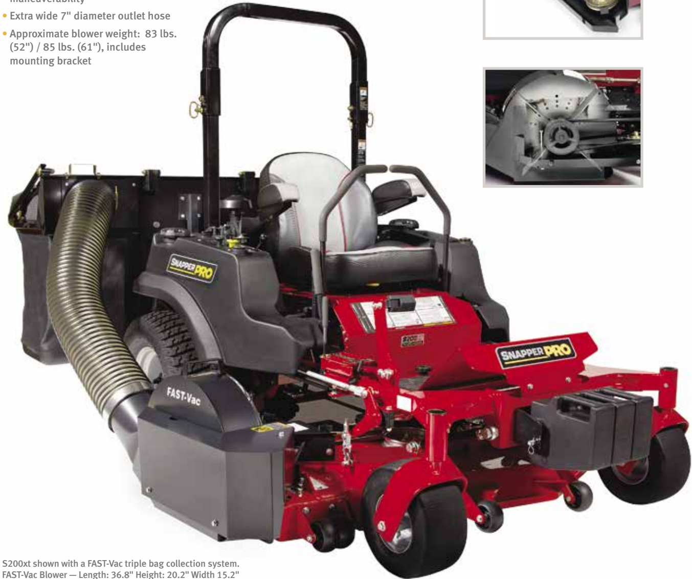
S200xt shown with a FAST-Vac triple bag collection system. FAST-Vac Blower — Length: 36.8" Height: 20.2" Width 15.2"