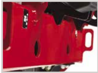
Robust 1/4" steel engine deck construction provides mounting area for bulky attachments.

The SW35 delivers consistently accurate cutting performance in diverse conditions. Built to run sunrise to sundown, this walk-behind is a productive performer for any size mowing crew.