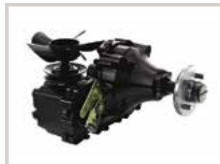
Dual, commercial Hydro-Gear® ZT-5400 Powertrain® Transaxles deliver unmatched power and durability.