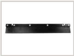
PROFESSIONAL STRIPE KIT Rubber flap system lays down grass to create patterns across the landscape. Standard on iCD™ Cutting System decks.