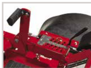
The easy-to-use deck-lift takes the effort out of adjusting cut height. Cutting height ranges from 1.5" - 6" in 0.25" increments.