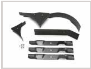
MULCH KIT Select kits include dedicated mulching blades, baffles, hardware and instruction sheet.