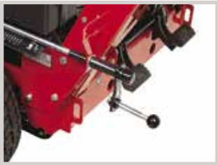
Set cutting height in one easy step using the quick-adjust crank.