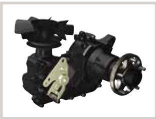
Dual, commercial Hydro-Gear® ZT-4400 Transaxles deliver unmatched power and durability.