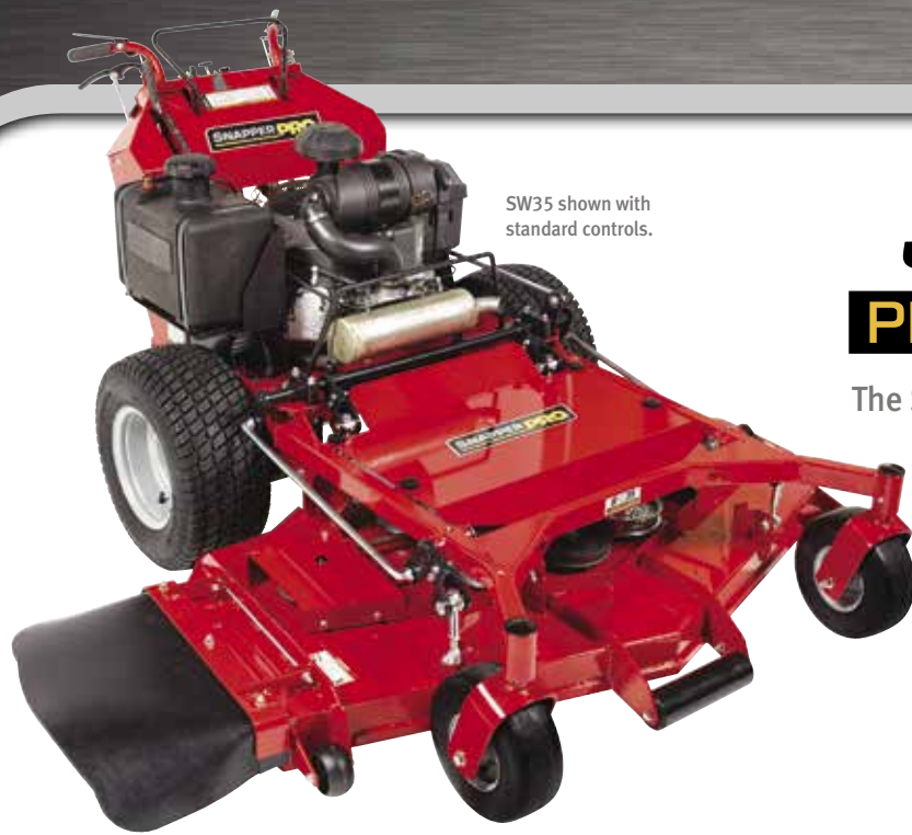
SW35 shown with standard controls.