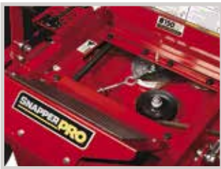
Quick removal of the floor pan provides convenient access to the top of the deck for easy cleaning and service.