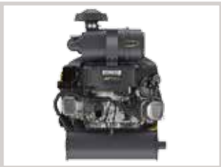
Vanguard™ 810 EFI Engines deliver more grass cutting capability than the leading EFI engine. Up to 25% fuel savings!