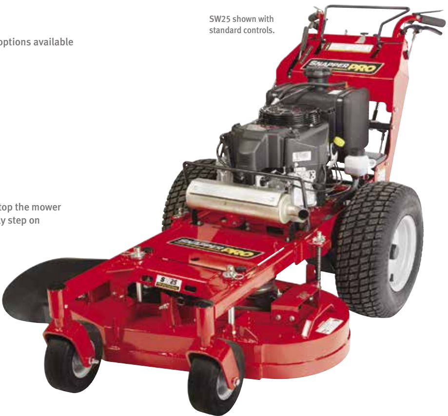
SW25 shown with standard controls.

Need to walk away from the mower to move an obstacle or debris? The new PTO switch allows the operator to stop the mower blades in a single step – simply put the machine in neutral and release the controls. The blades will disengage while the engine continues to run.