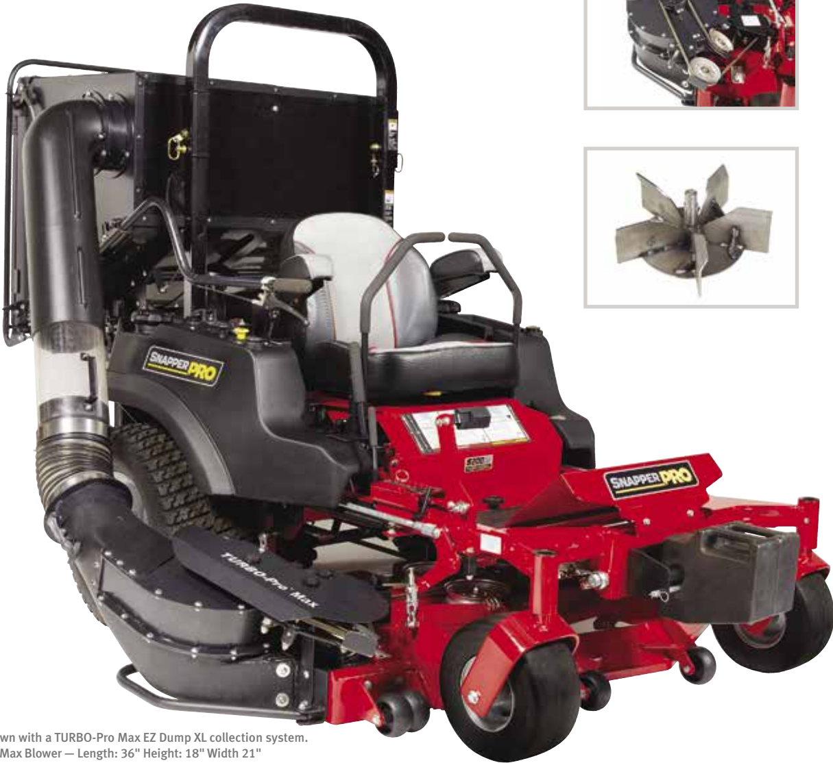
S200xt shown with a TURBO-Pro Max EZ Dump XL collection system. TURBO-Pro Max Blower — Length: 36" Height: 18" Width 21"