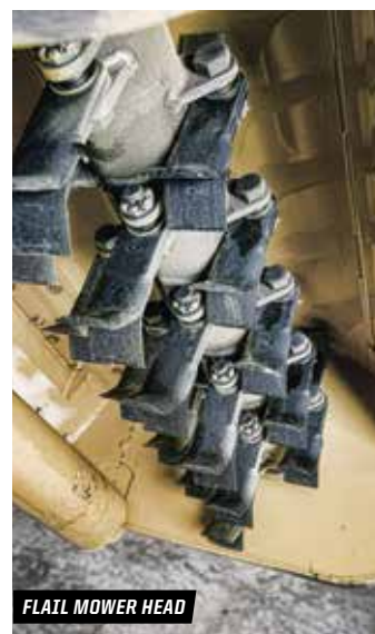
FLAIL MOWER HEAD