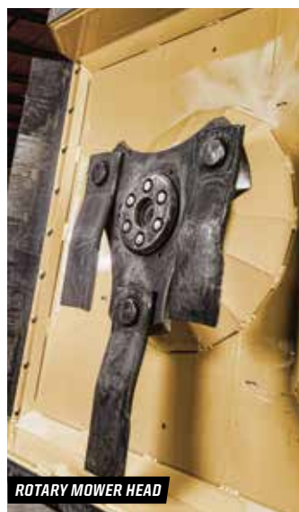
ROTARY MOWER HEAD