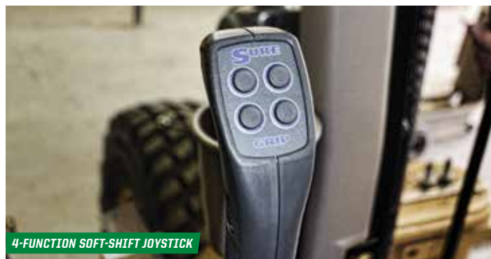
4-FUNCTION SOFT-SHIFT JOYSTICK

All Diamond 3-point hitch boom mowers come standard with 4-Function Soft-Shift Joystick.