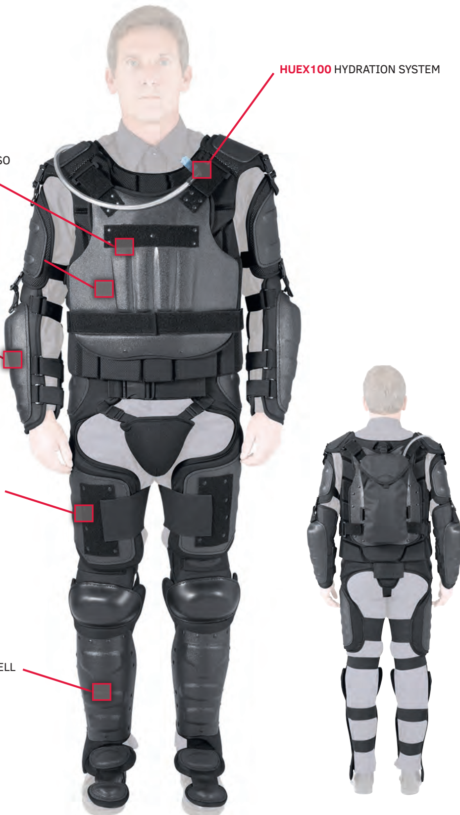
TS70 HARD-SHELL SHIN GUARD