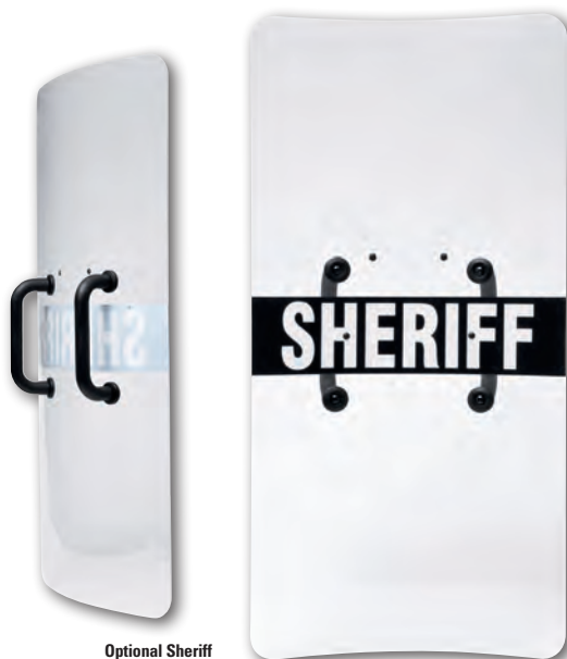
Optional Sheriff Decal Shown