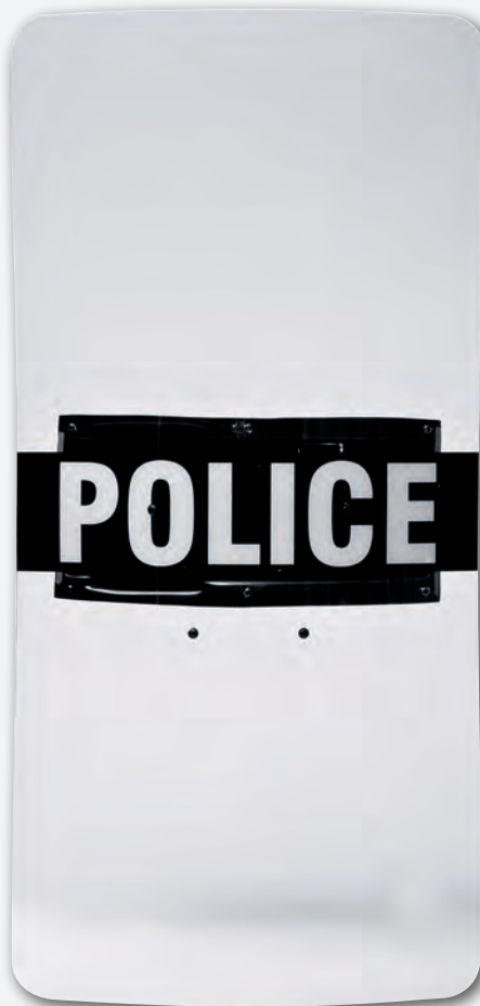
FRONT Optional Police Decal Shown