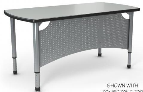
SHOWN WITH TOMBSTONE TOP