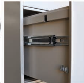
Steel Ball Bearing Suspension