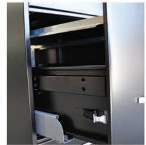
Heavy Gauge Triple-Tied Steel Cradle Suspension

All Invincible™ Vertical file cabinets are available in letter and legal widths with a 28 inch depth.