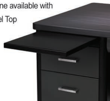
M-Line with Steel Top