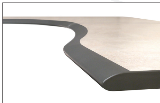
• MT6F Comfort Profile PURTech® Edge