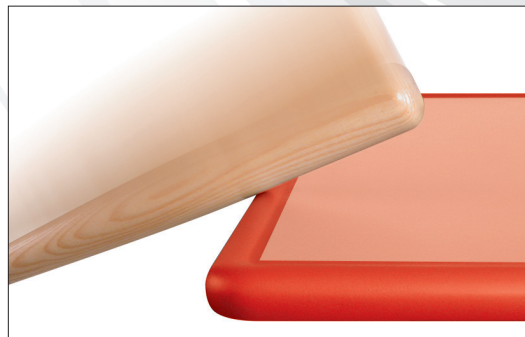
• MA2 No-Drip Profile PURTech® Edge

• UV resistant material will not change color or break down over time.