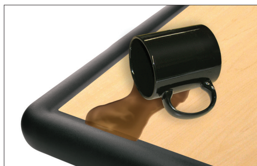
• MA2 No-Drip Profile PURTech® Edge