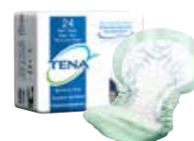
TENA® Night/Super Pad

Please note: NOT recommended for loose or chronic stools related to diuretics, tube feeding or an IV