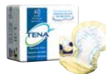
TENA® Day Plus Pad