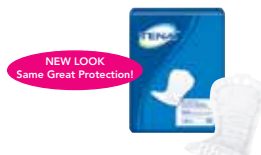
TENA® Day Light Pad