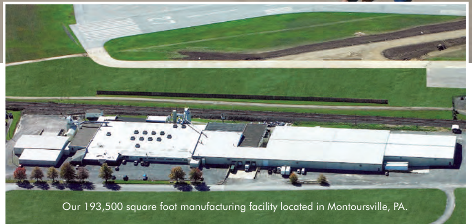
Our 193,500 square foot manufacturing facility located in Montoursville, PA.

Every employee is in charge of quality assurance.