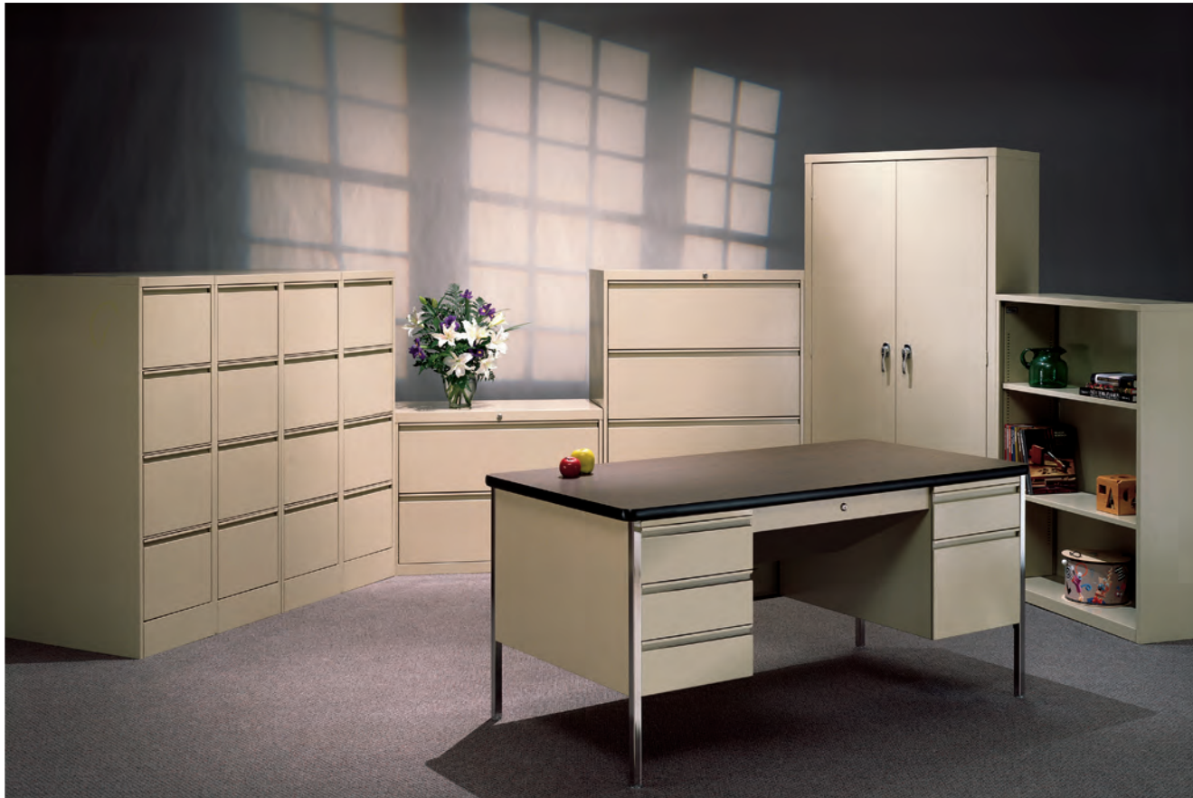
Pictured from L to R: 700 Series vertical files; 800 Series lateral files; Storage Closet; Bookcase; 1000 Series desk