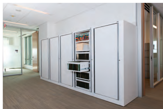
EZ2® Rotary Action Files