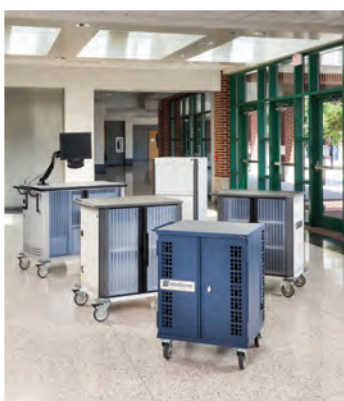
Intellurum™ computer security