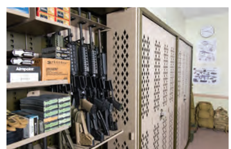
ArgosSECURITY™ weapon storage