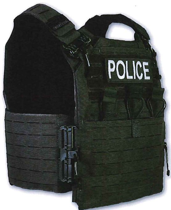
SHOWN IN AWS FST VARIANT WITH OPTIONAL TRIPLE M4 MAG CARRY SET