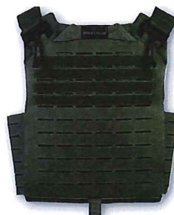
BACK SHOWN IN AWS FST VARIANT