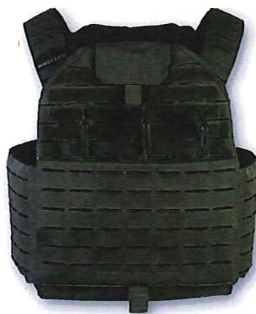
FRONT SHOWN IN AWS QRS VARIANT