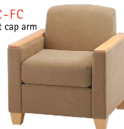
PU-C-FC chair - flat cap arm