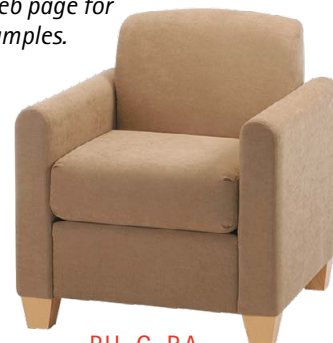
PU-C-RA chair - round arm