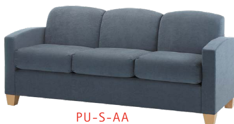
PU-S-AA sofa - available in all styles