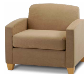
BARIATRIC CHAIRS shown: PU-BC-SA available in all arm styles