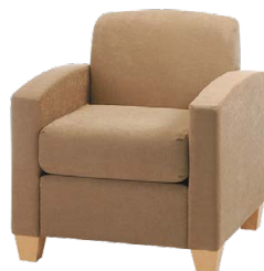
PU-C-AA chair - arched arm