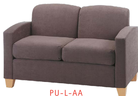
PU-L-AA loveseat available in all styles