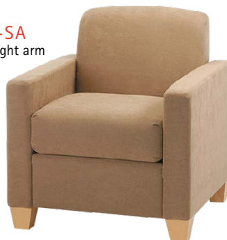
PU-C-SA chair - straight arm