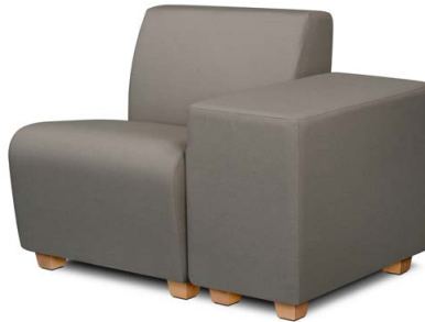
RD3-S1-28 WITH RD3-TBA16-UPH 28" single-seat unit with 16" table arm with upholstered top