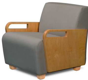
RD3-C-WA-28 chair with wood arms