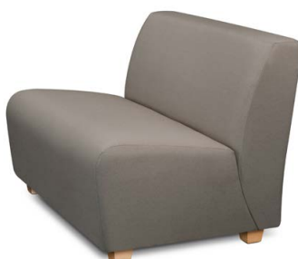
RD3-S2 44" Armless Double-Seat