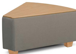
RD3-45-SPN-SS 45° Wedge Spanner with Solid Surface Top*