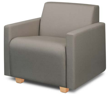
RD3-C-SA4-UPH-28 chair with 4" straight upholstered arms Also available with wood arm caps