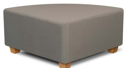
RD3-90-SPN-UPH 90° Wedge Spanner with Upholstered Top*

*All Wedge Spanners work with Inside or Outside configurations, and are available with upholstered or solid surface tops.