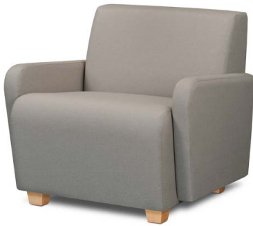
RD3-C-SL-28 chair with sloped arms