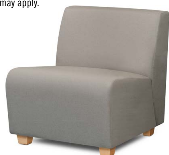
RD3-S1-28 28" Armless Single-Seat