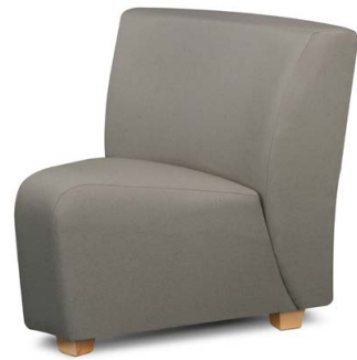
RD3-45-IW 45° Armless Inside Wedge Seat