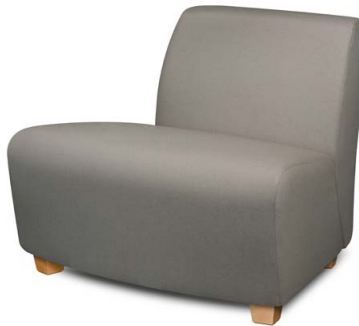
RD3-30-OW 30° Armless Outside Wedge Seat