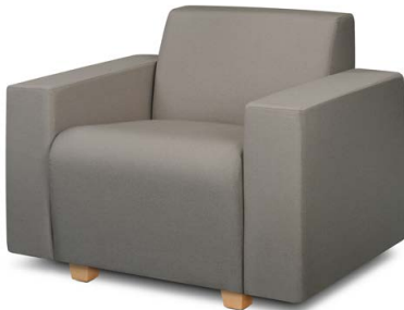
RD3-C-SA8-UPH-28 chair with 8" straight upholstered arms Also available with wood arm caps