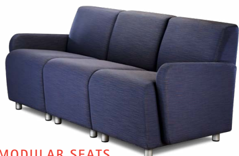
MODULAR SEATS shown with 28" S1 seats & SL arms

Multiple Ridge Ottomans can easily be ganged together to create modular benches of whatever length you want.