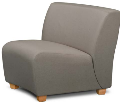
RD3-30-IW 30° Armless Inside Wedge Seat

Wood Caps are available for 4", 8" and 16" Straight arms.