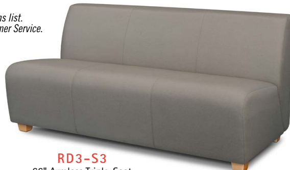
RD3-S3 66" Armless Triple-Seat

Multiple Ridge Ottomans can easily be ganged together to create modular benches of whatever length you want.