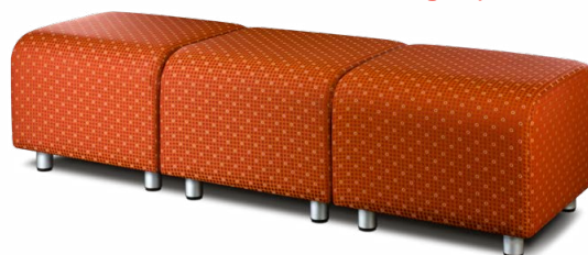
MODULAR BENCHES ottoman - ganged