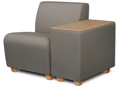
RD3-S1-28 WITH RD3-TBA16-SS 28" single-seat unit with 16" table arm with solid surface top