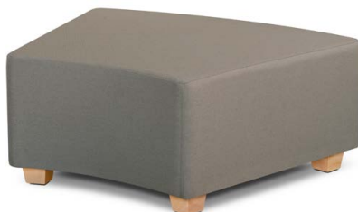
RD3-30-SPN-UPH 30° Wedge Spanner with Upholstered Top*