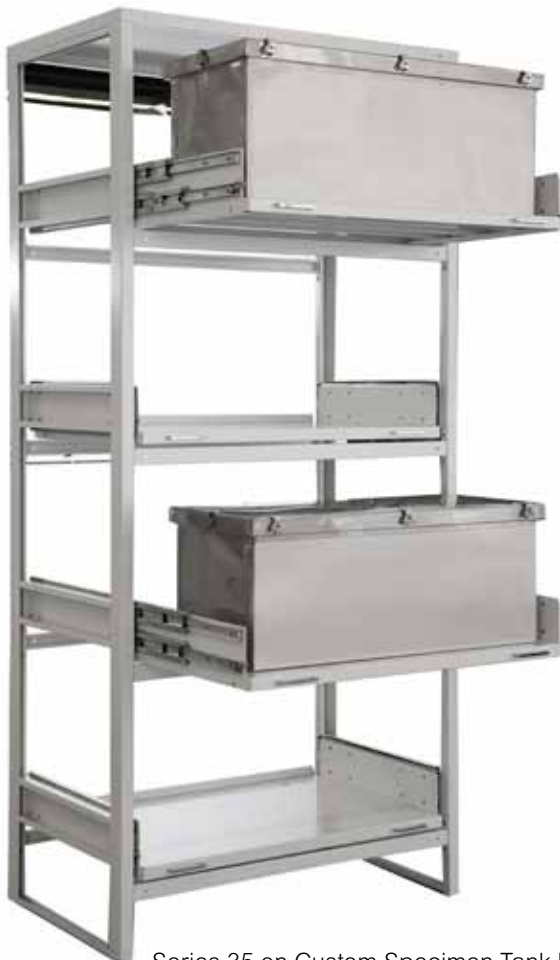
Series 35 on Custom Specimen Tank Rack