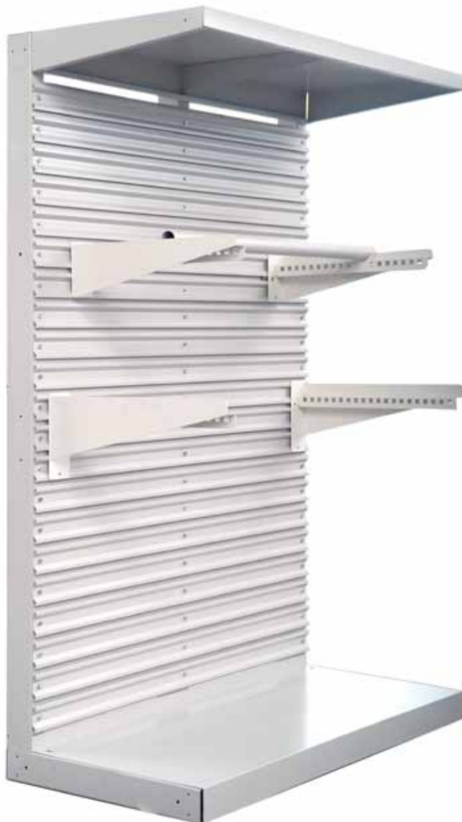
Cantilever Textile Rack

Racks are designed to allow attachment to floor or mobile system.