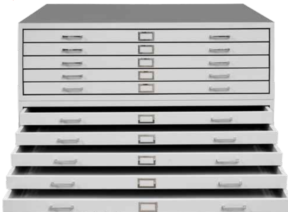
(2) 5442 stacked