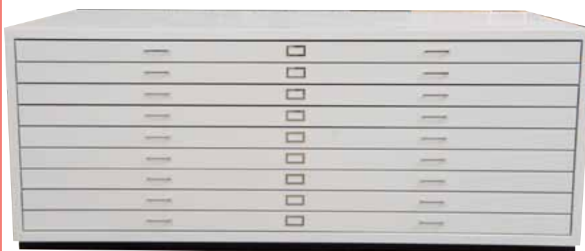
Oversized Custom Flat File