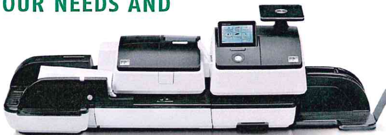
POSTBASE 85 WITH AUTO-FEEDER & SEALER

**Auto-feed available on 45, 65 or 85 models.