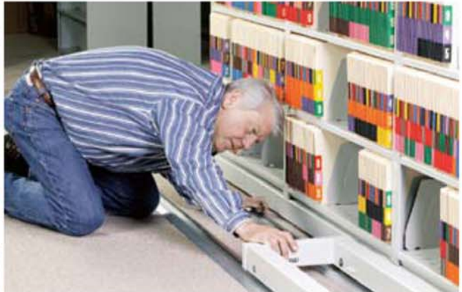
4. Use carriage to set front track. Level, if necessary. Fasten tracks to floor. Attach rear anti-tip brackets to carriages.