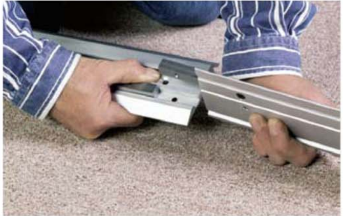
2. Assemble track pieces to system length.