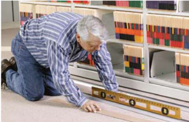
3. Lay down rear track. Check level and shim if necessary.