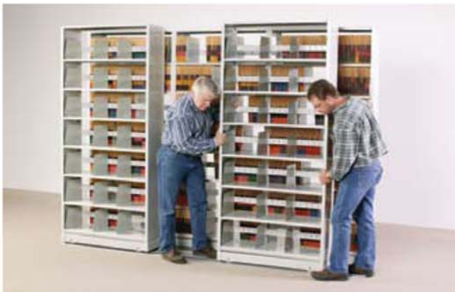
5. Set shelving on carriage(s).