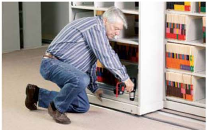
6. Attach shelving to carriage with screws provided.