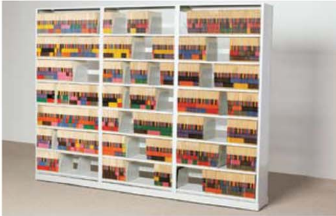
1. Set rear units in place, if not already existing.