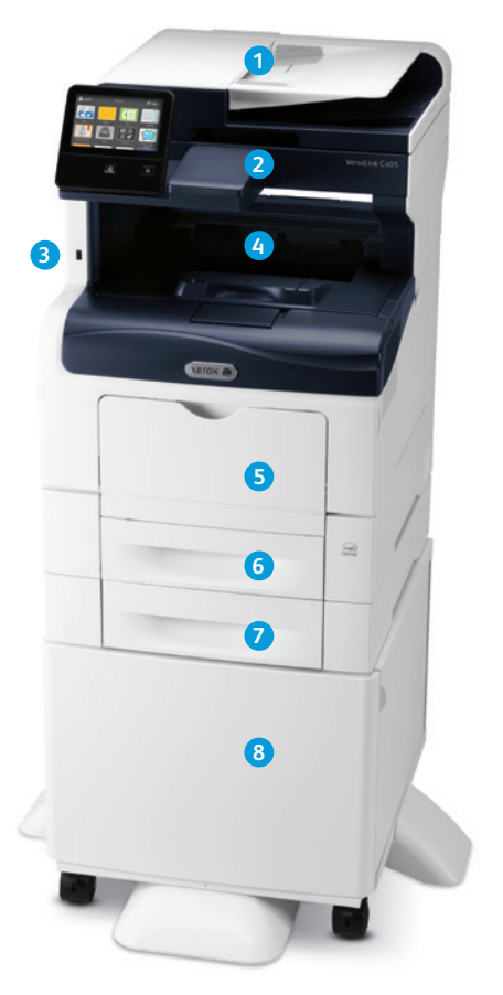
Xerox® VersaLink® C405 Color Multifunction Printer Print. Copy. Scan. Fax. Email.