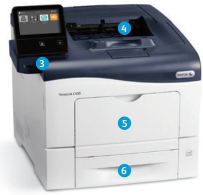
Xerox® VersaLink® C400 Color Printer Print.

<sup>2</sup> USB ports can be disabled; <sup>3</sup> VersaLink C405 only.