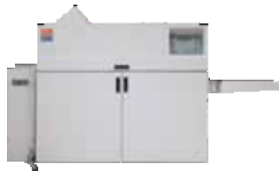
C.P. Bourg BDFNx Booklet Maker with Square Edge