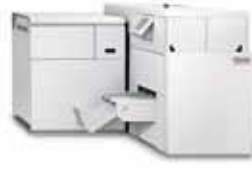
Watkiss PowerSquare 200