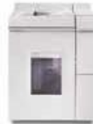
Basic Finisher Module