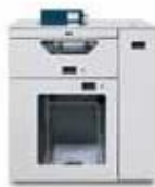
C.P. Bourg BSFx Dual-Mode Sheet Feeder