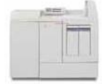
Xerox® DB120-D Document Binder