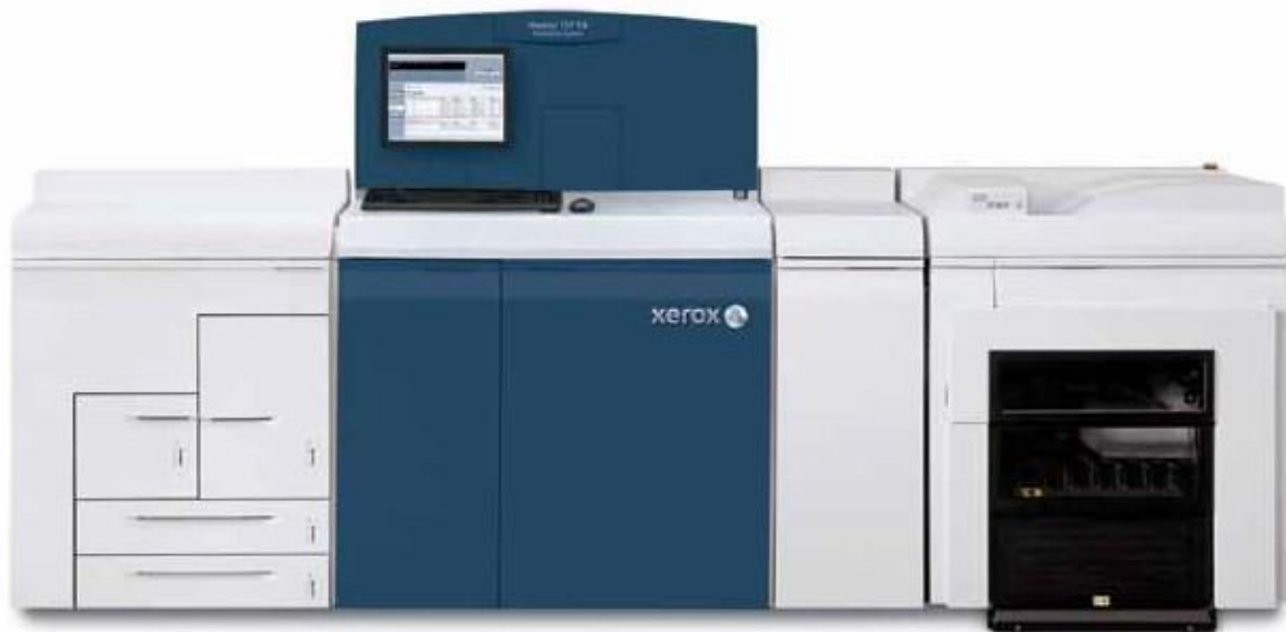
Xerox Nuvera® 157 EA Production System with Xerox® Production Stacker