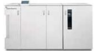
GBC FusionPunch II with Offset Stacker