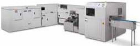
Xerox® Book Factory