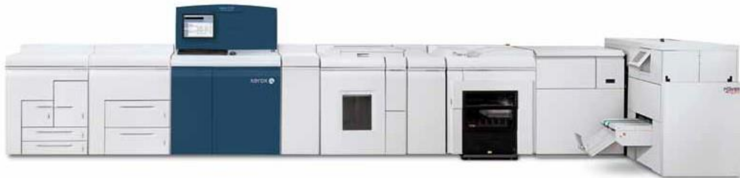
Xerox Nuvera® 157 EA Production System with Xerox® Production Stacker and Watkiss PowerSquare 200