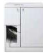
Xerox® Tape Binder