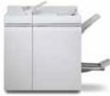
Multifunction Finisher Pro Plus