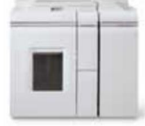
Basic Finisher Module – Direct Connect