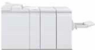
Plockmatic Pro 30 Booklet Maker (Available on 100 only)