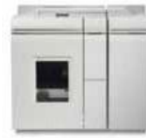
Basic Finisher Module Plus