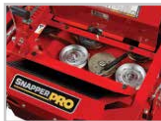
Quick removal of the floor pan provides convenient access to the top of the deck for easy cleaning and service.