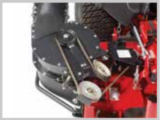
Heavy-duty oversized drive and idler pulleys combined with a long drive belt allow for cool running and maximum belt life.