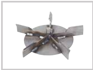
The curved blade impeller reduces impeller speed and noise while maximizing air velocity.