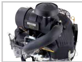
Vanguard™ BIG BLOCK™ engine provides increased horsepower and more torque.