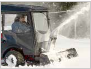
SNOWBLOWER/CAB Two-stage 60" snowblower and cab available on S800x.