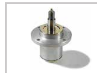
CAST-ALUMINUM SPINDLES Feature 1" shaft with 2.5" x 1" dual ball bearings with top access grease fittings and pressure relief valve.