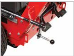
Set cutting height in one easy step using the quick-adjust crank.