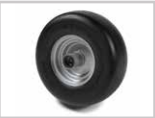
FLAT-FREE CASTER TIRES Run all day with no flats, eliminates downtime. Standard on select models.