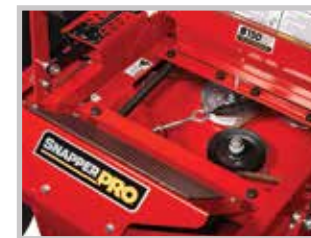
Quick removal of the floor pan provides convenient access to the top of the deck for easy cleaning and service.