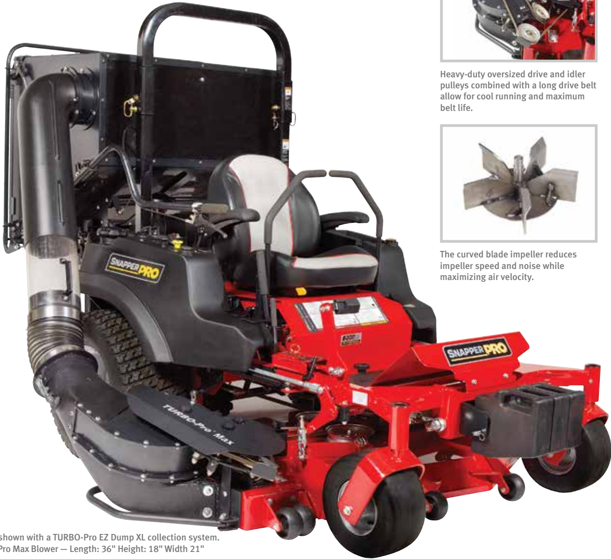
S200xt shown with a TURBO-Pro EZ Dump XL collection system. TURBO-Pro Max Blower — Length: 36" Height: 18" Width 21"