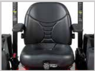
SUSPENSION SEAT Suspension seat for optimal comfort available on S800x, S200xt, and S150xt.