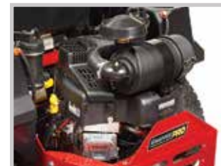
Vanguard™ 810cc engines deliver the optimum power, performance, and efficiency commercial zero-turn mowers need.