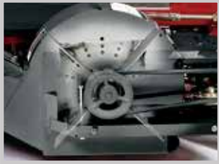
Extremely rugged impeller rides on industrial-grade bearings to generate a phenomenal airflow.