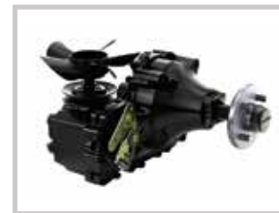
Dual, commercial Hydro-Gear® ZT-5400 Powertrain® transaxles deliver unmatched power and durability.