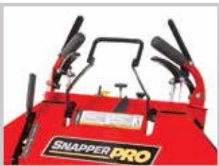
Reliably set your speed with the improved easy-to-reach cruise control bar featuring a speed indicator. Conveniently located brake handle.