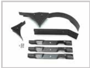
MULCH KIT Select kits include dedicated mulching blades, baffles, hardware and instruction sheet.

*Optional on S200XTB2761. **Optional on 36" models. †Optional on 48" and 52" models. ‡Optional on 48" models.