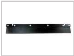
PROFESSIONAL STRIPE KIT Rubber flap system lays down grass to create patterns across the landscape. Standard on iCD™ Cutting System decks.