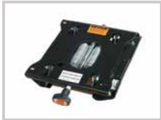
SUSPENSION SEAT INSERT Add this to the premium seat on the S800x for increased comfort.