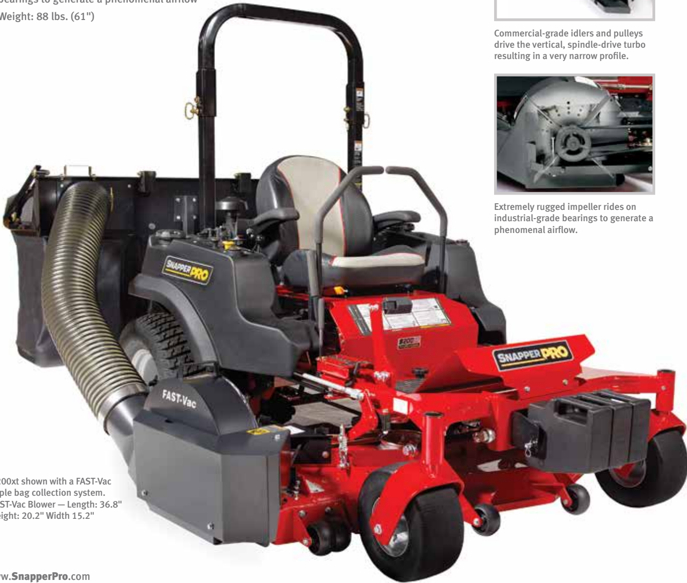
S200xt shown with a FAST-Vac triple bag collection system. FAST-Vac Blower — Length: 36.8" Height: 20.2" Width 15.2"