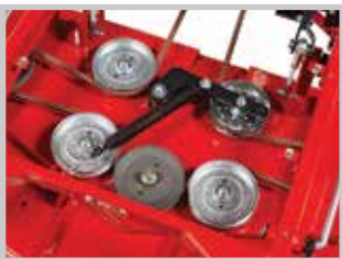
Deck drive belt system is designed to provide even belt tension which improves the life of the belt and reduces maintenance.