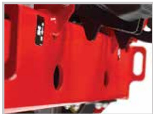
Thick 1/4" engine deck construction provides robust mounting area for sully attachments.

The SW35 delivers consistently accurate cutting performance in diverse conditions. Built to run sunrise to sundown, the walk-behind is a productive performer for any size mowing crew.