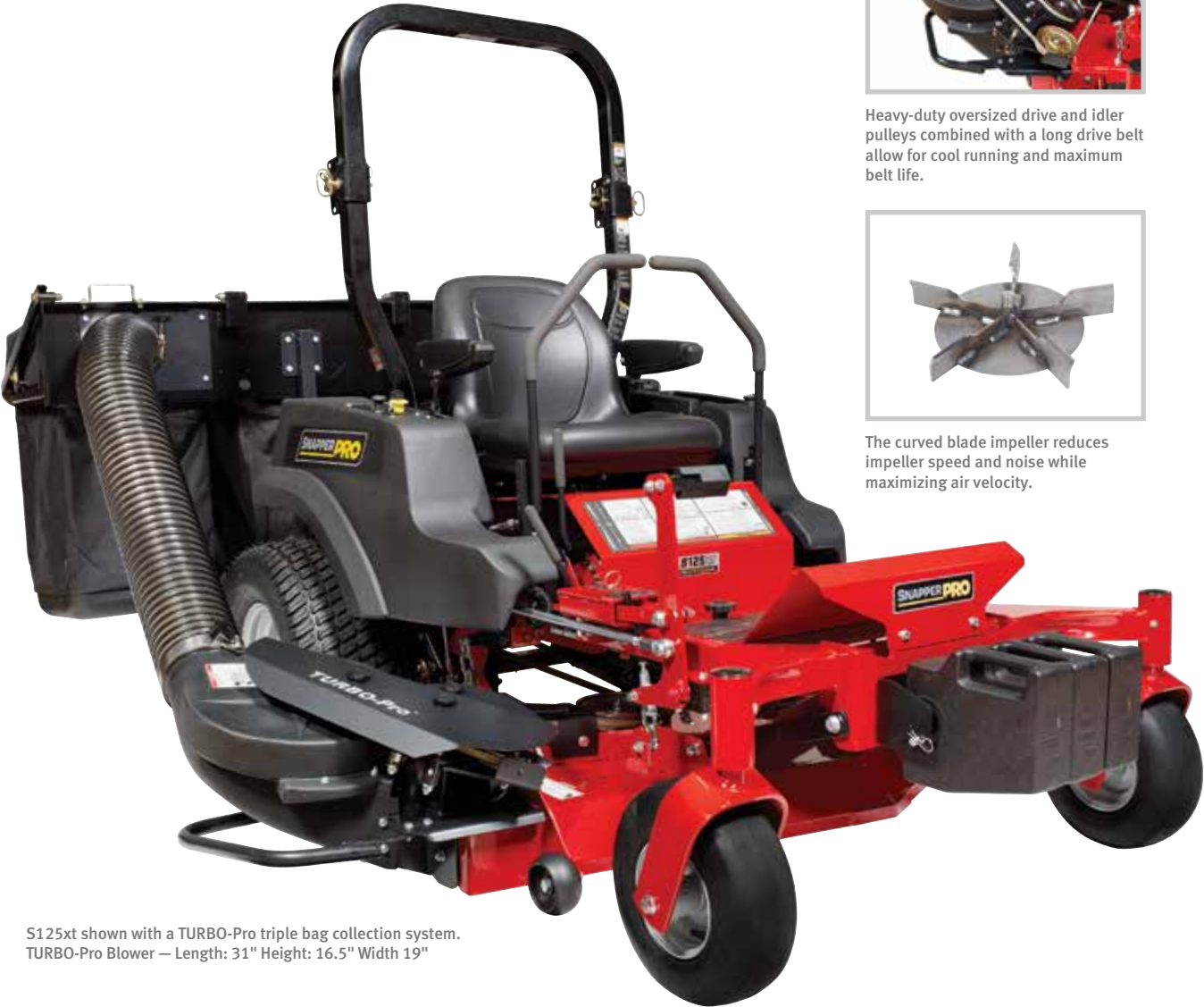
S125xt shown with a TURBO-Pro triple bag collection system. TURBO-Pro Blower — Length: 31" Height: 16.5" Width 19"