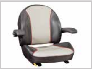
PREMIUM SEAT High quality adjustable seat features red trim with foldable arm rests for added comfort. Optional on S125xt.