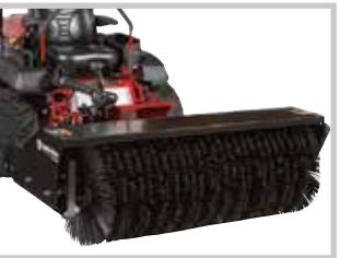
60" BROOM/CAB Clear debris and snow right down to the pavement. Bidirectional operation can be changed from the seat. (Cab enclosure available, not shown.)