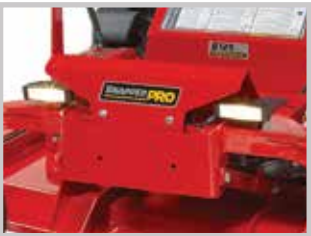
LIGHT KIT Select zero-turn models are pre-wired for simple installation.