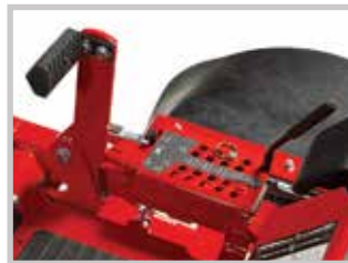
The easy-to-use deck-lift takes the effort out of adjusting cut height. Cutting height ranges from 1.5" - 6" in 0.25" increments.