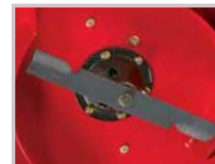
MARBAIN STEEL BLADES Our exceptionally strong 1/4" thick blades generate greater lift for a precision cut and require less frequent sharpening.