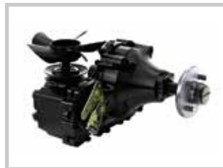
Dual, commercial Hydro-Gear® ZT-5400 Powertrain® transaxles deliver unmatched power and durability.