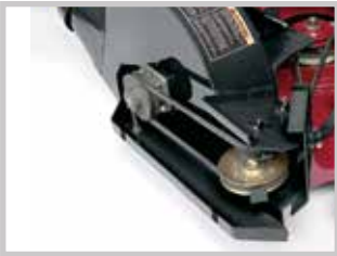
Commercial-grade idlers and pulleys drive the vertical, spindle-drive turbo resulting in a very narrow profile.