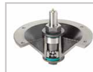
HERCULES™ II SPINDLES Cast-iron 10" dia. greaseable spindles with industrial double row angular contact ball bearings with 1 3/16" dia. shaft.