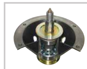
CAST-IRON SPINDLES Longer usable life, 1" shaft with top access grease fitting, six-bolt 8" flange design adds strength and greater dispersal of energy to deck assembly.