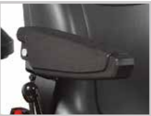
ARM RESTS Add these foldable arm rests for increased riding comfort on S50xt.