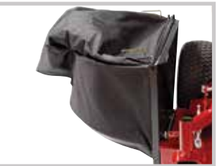
GRASS CATCHER A lightweight durable 3.75 bushel, fabric bag with hard plastic bottom attaches quickly.