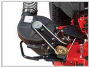
Heavy-duty oversized drive and idler pulleys combined with a long drive belt allow for cool running and maximum belt life.