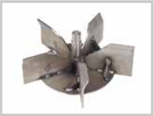
The curved blade impeller reduces impeller speed and noise while maximizing air velocity.