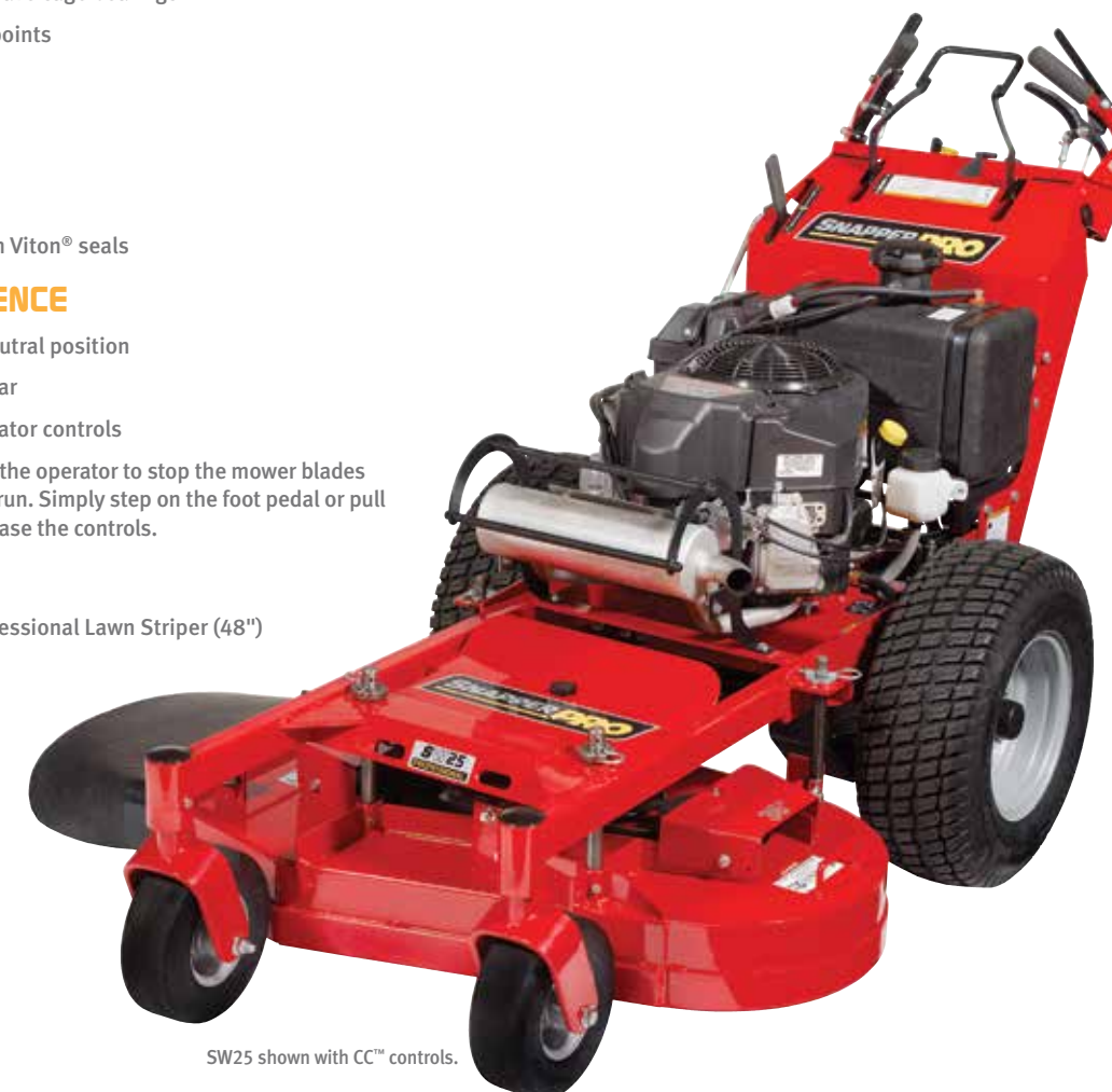
SW25 shown with CC™ controls.

Need to walk away from the mower to move an obstacle or debris? The new PTO switch allows the operator to stop the mower blades in a single step – simply put the machine in neutral and release the controls. The blades will disengage while the engine continues to run.