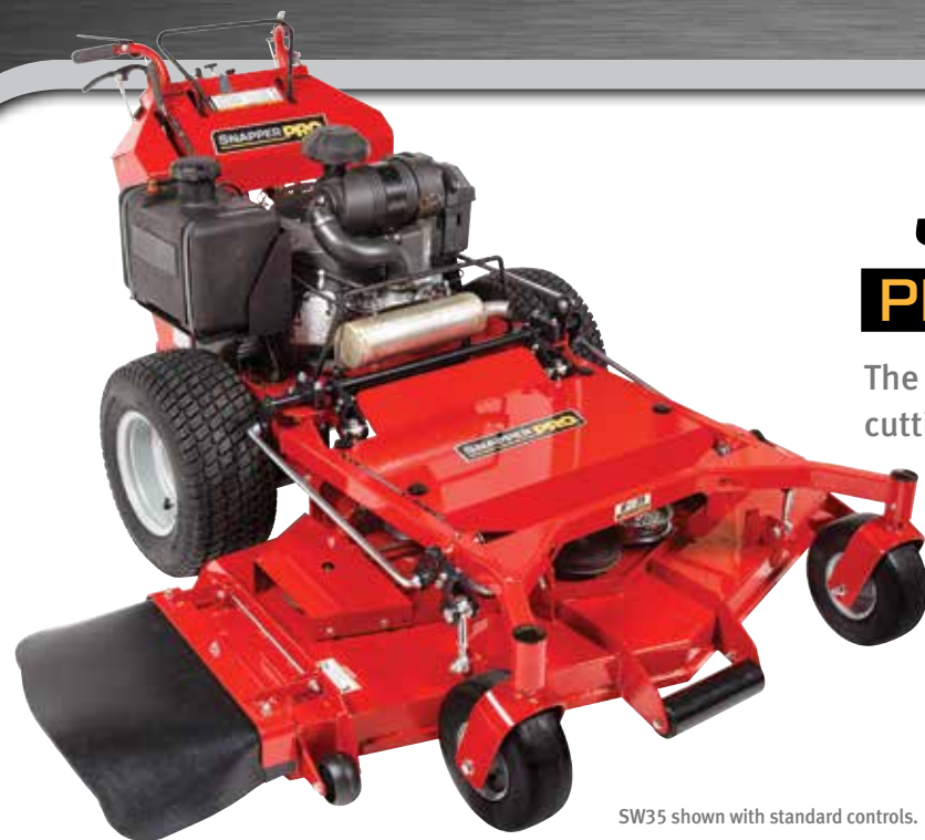
SW35 shown with standard controls.