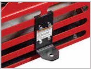
TRAILER HITCH KIT Will accept a 1/2" shank ball and comes complete with hardware.