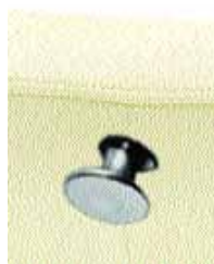
Specially designed brush steel knob for easy mobility standard on E3101 only