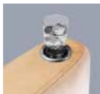
Optional Brushed Metal Insert Cup Holder