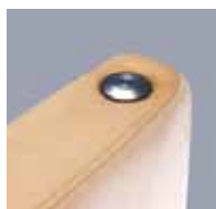
Tablet Pivot Insert