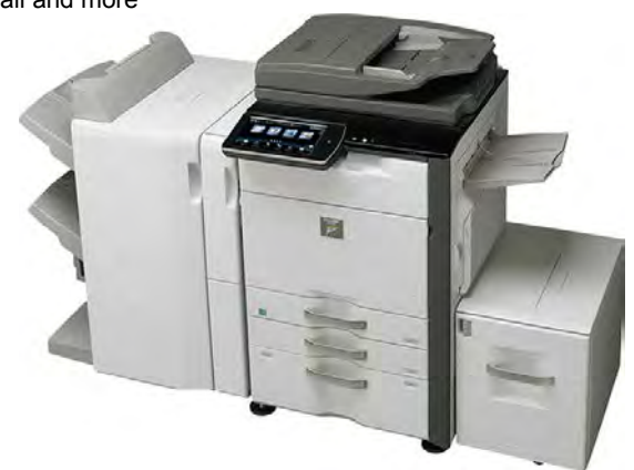
MX-4140N shown with optional accessories