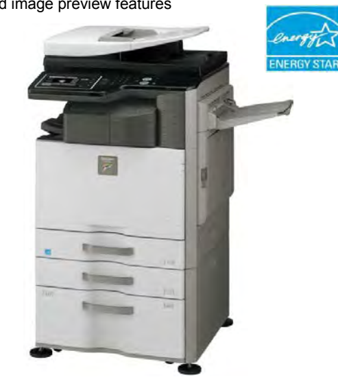
MX-3116N shown with optional accessories