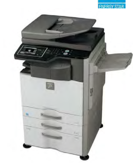
МХ-2615гу эпоми мил орионал ассеssories