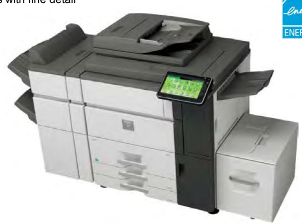
MX-6240N shown with optional accessories