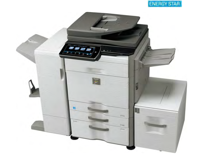
MX-3640N shown with optional accessories