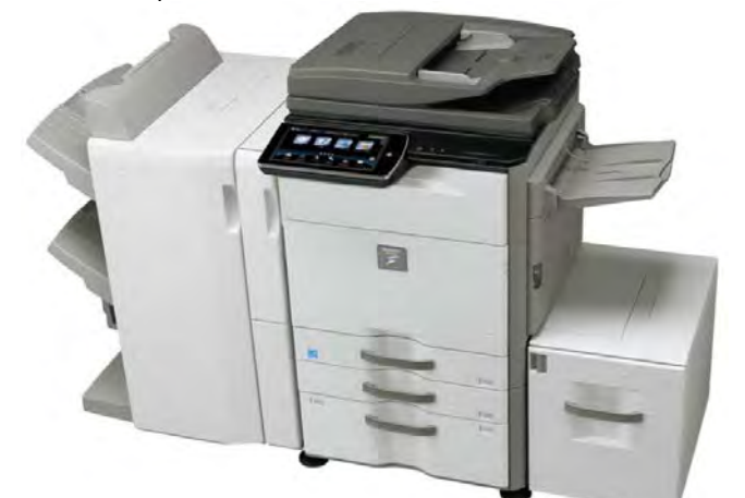
MX-M565N shown with optional accessories