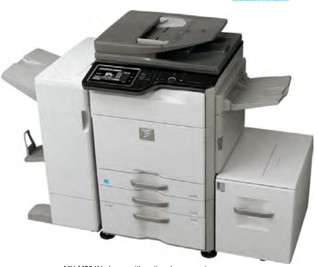
MX-M564N shown with optional accessories