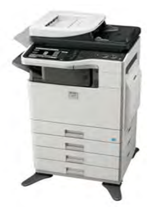
MX-C402SC shown fully configured with optional accessories