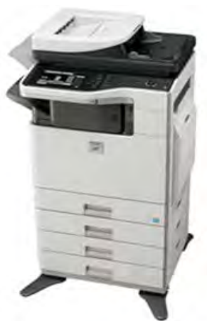
MX-B402SC shown fully configured with optional accessories