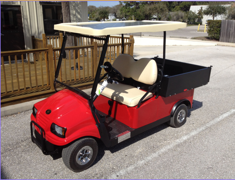
Standard Model with Solar Option