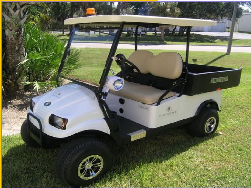
Model shown with Optional Lift Kit, Strobe Light and Hand Held Spotlight