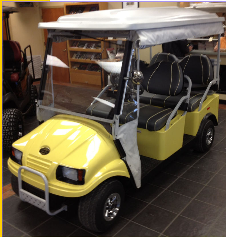
Shown with Optional Upgraded Seats, Custom Colors, and Canvas Enclosure