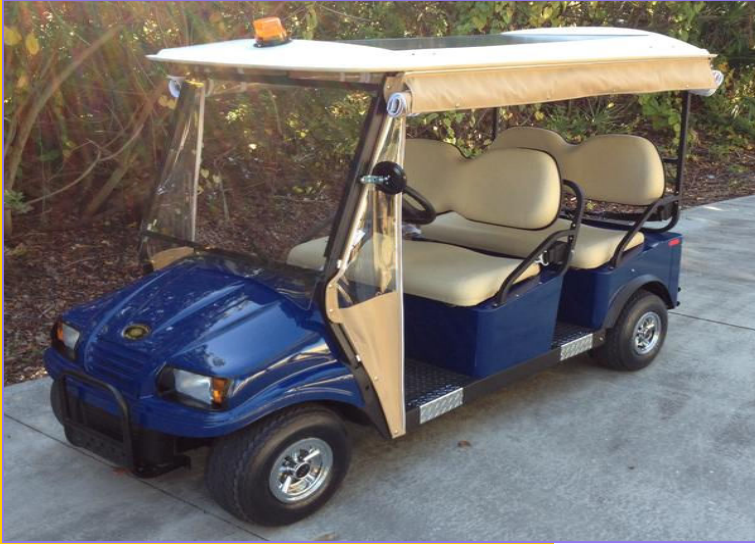
Shown with Optional Solar Canopy, Strobe Light, and Canvas Enclosure