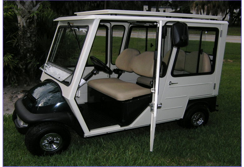
Shown with Optional Hard Doors and Solar Top