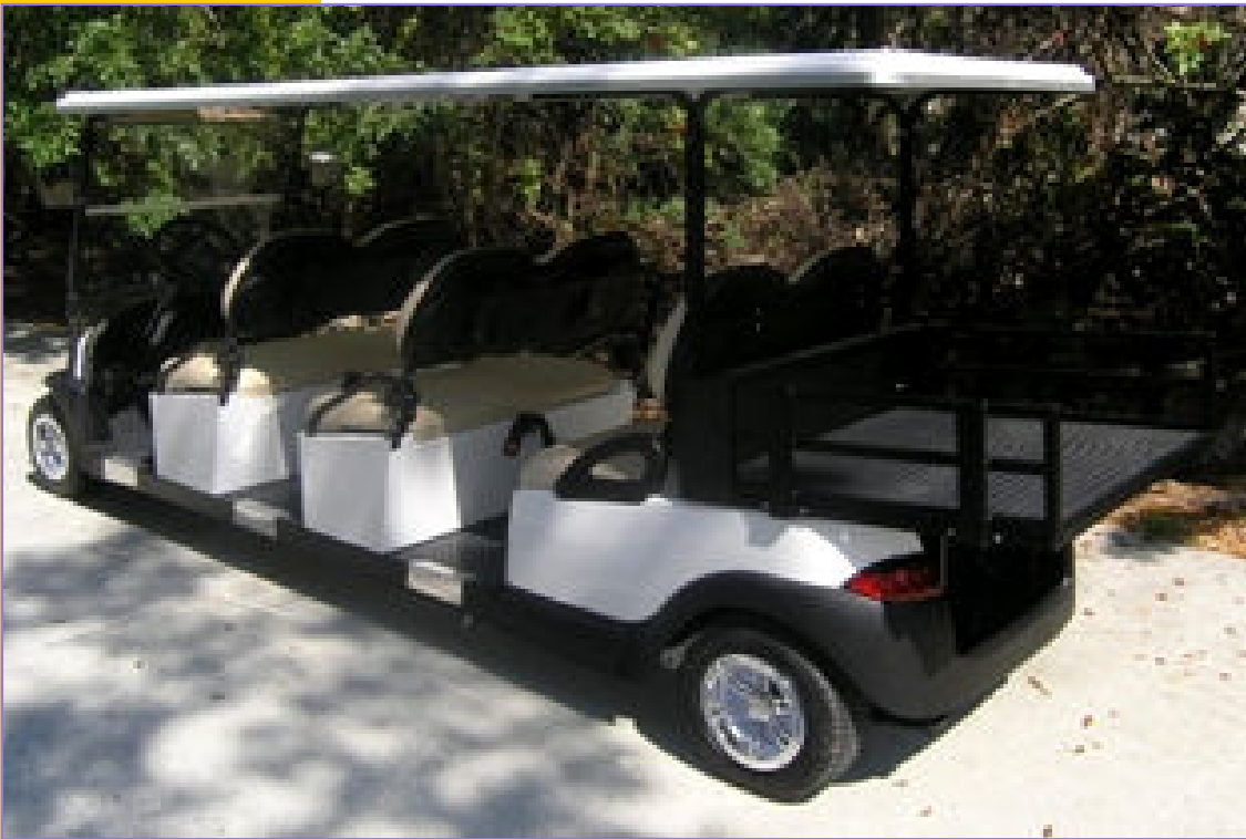
Shown with option to convert to a six passenger with a permanent Stake Bed