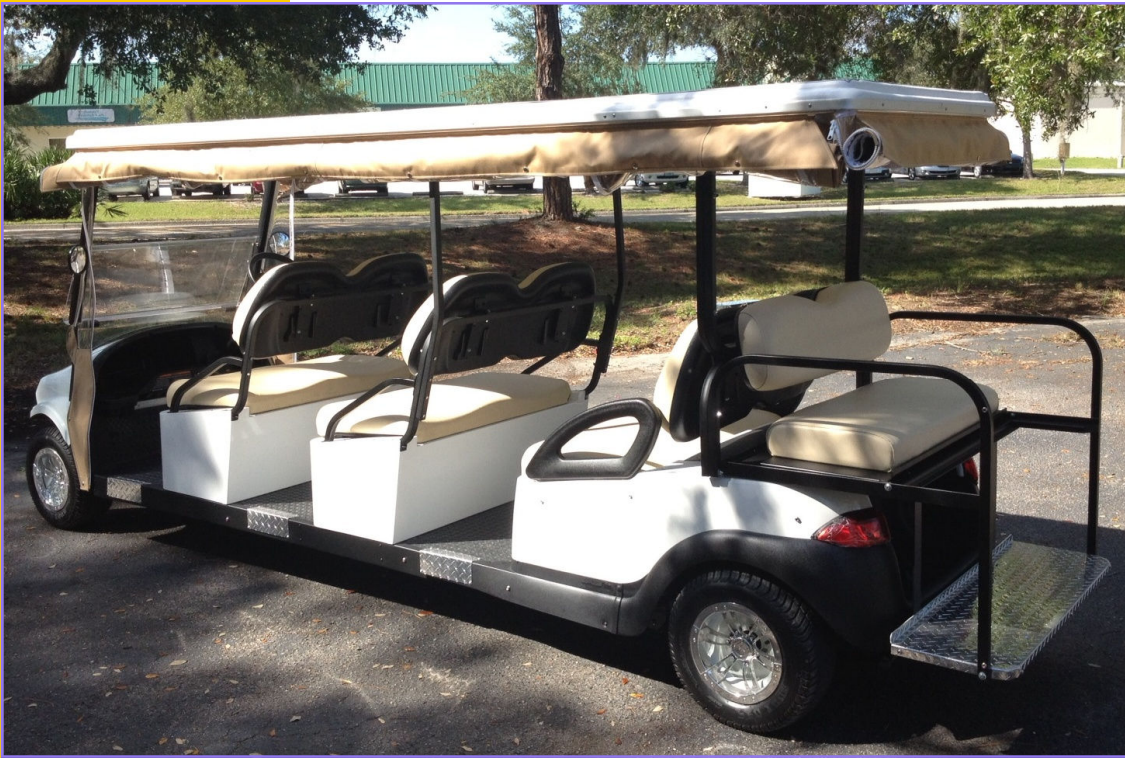
Shown with Optional Canvas Enclosure