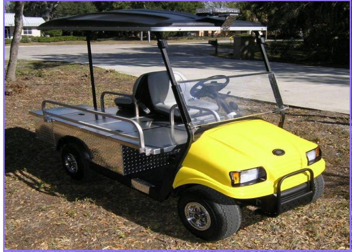
R2AMB - STRETCHER CARRIER CART Two Passenger Utility Cart with Stretcher Platform

Standard Equipment: Headlights, Tail lights , Brake Lights, Horn, Windshield, Canopy Top, High Speed Code, and State of Charge Meter.