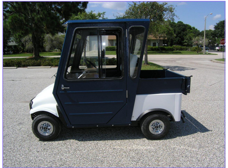
Shown with Hard Door Option