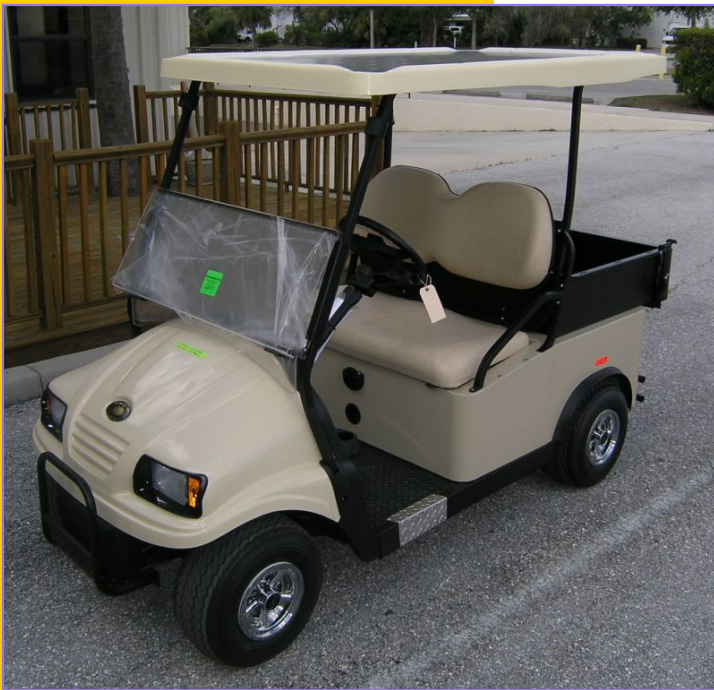
Shown as Standard Cart with Solar Option