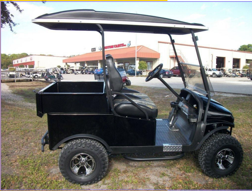
Shown with Lift Kit and matching canopy