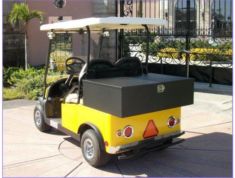
Shown with Locking Cargo Box