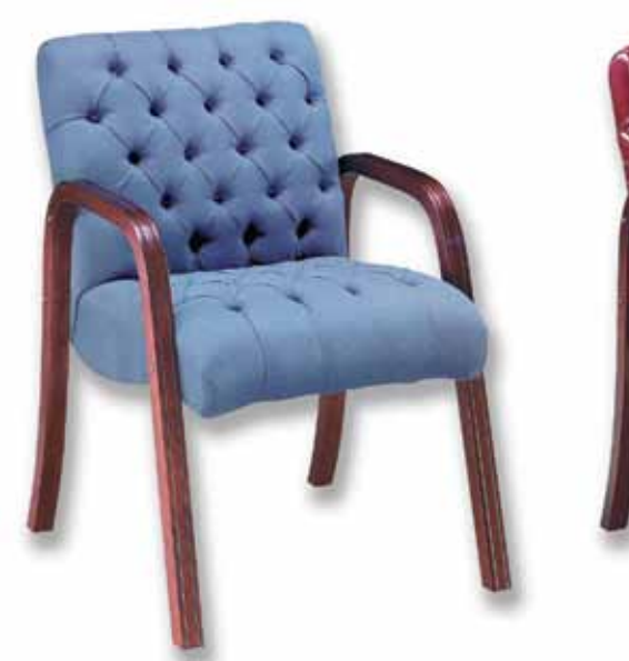
4122 Guest Wood Arms MAH Mahogany Cross Check 299-044 Lapis