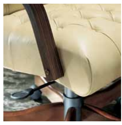
Waterfall Front Seat Edges provide relaxed comfort, promoting proper circulation and reducing leg fatigue during extended work periods