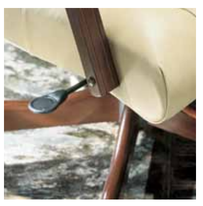
Pneumatic Lift allows easy-operation seat-height adjustment. Standard on all swivel tilt chairs