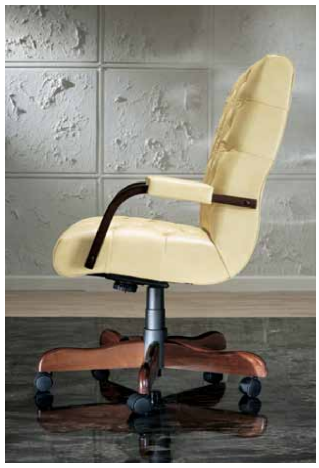
Body Form Shape features built-in lumbar support for long-term comfort whether sitting upright or reclining