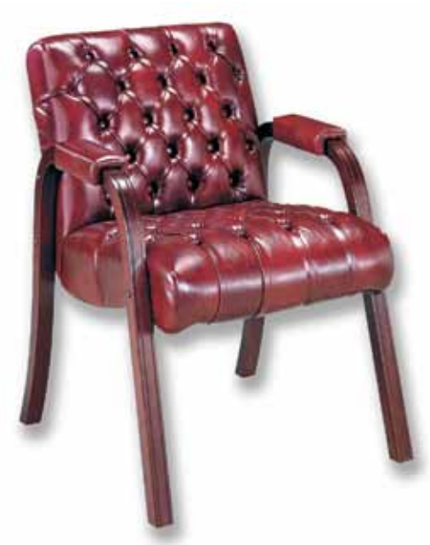
4123 Guest Padded Arms MAH Mahogany Jamestown 361 Oxblood