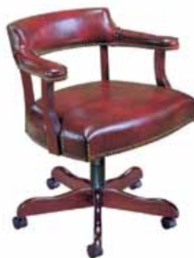
4017 Management Swivel MAH Mahogany Jamestown 361 Oxblood