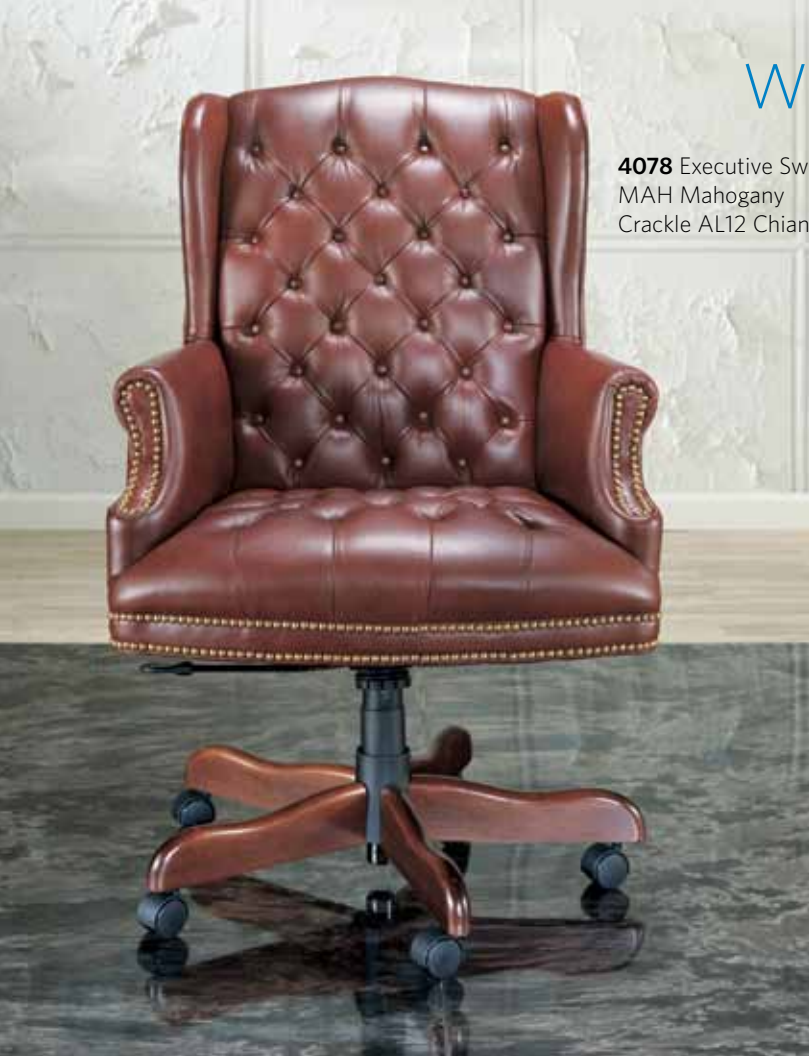
4078 Executive Swivel MAH Mahogany Crackle AL12 Chianti Leather