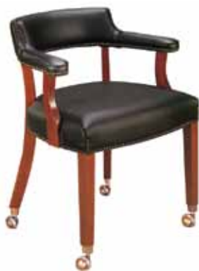
4016 Conference Chair WC Windsor Cherry Mammut (Bronco) 250599 Black Leather