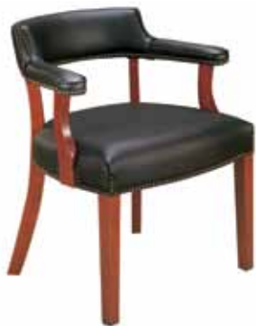
4013 Arm Chair WC Windsor Cherry Mammut (Bronco) 250599 Black Leather