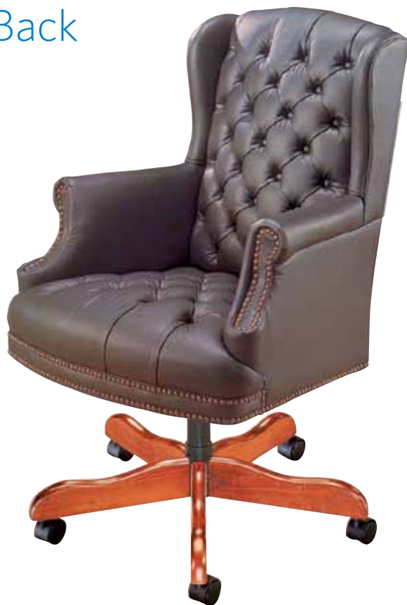
4077 Swivel WC Windsor Cherry Mammut (Bronco) 250599 Black Leather

Traditional Seating features period influences to create Wing Back, Gooseneck and other classic styles. Traditional tufting, individually-placed brass nail trim and shaped wood base caps enhance the design. All swivel tilt chairs include pneumatic lift for easy seat-height adjustment and tilt tension knob for individualized comfort. Standard black, dual-wheel casters; hard floor casters available. Limited lifetime warranty.