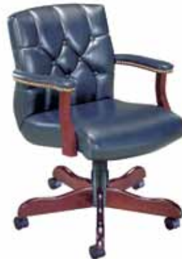
4837 Management Swivel MAH Mahogany Jamestown 360 Antique Blue