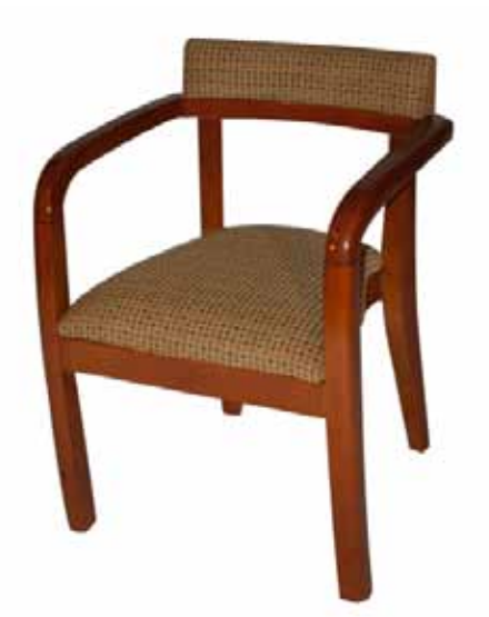
683U Open Back with Upholstered Rail RM Rouge Mahogany COM Fabric