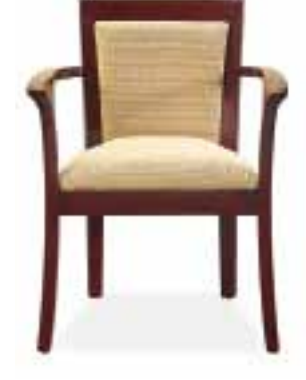
695 Fullback Guest Chair RM Rouge Mahogany Structure 286-007 Paperbag

All HPFI seating available in several finishes and over 60 upholstery options at industry-leading Quick Ship lead times. Dimensions listed are width/depth/height over-all. Reference current price list for complete descriptions. Specifications subject to change without notice.