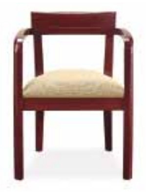
683 Open Back Guest Chair RM Rouge Mahogany Structure 286-007 Paperbag