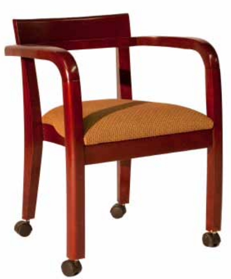
683C Open Back with Casters RM Rouge Mahogany COM Fabric

693U Upholstered Over Lattice Back RM Rouge Mahogany COM Fabric