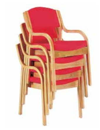
All Corbel chairs stack up to five high.