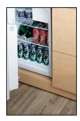
Hyperwork Server Credenza HWFM2248