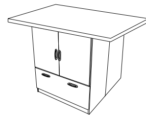
64"W x 60"D Work Area