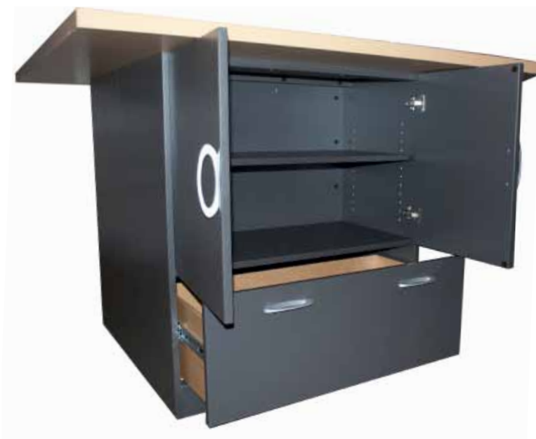
PDGP42STOR Storage Cabinets (2) PA1FMT6460 Top Surface