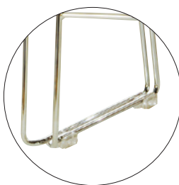
Standard Clear Glide/Ganging clip connects individual chairs with ease.