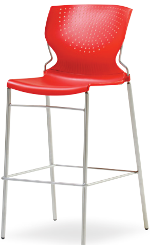
SD-15-STL-NIC-REAL RED (2)