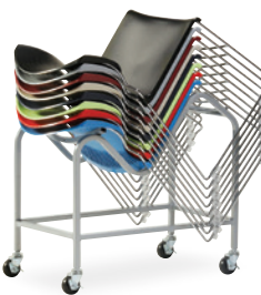
Stacks 10 on floor and 25 on optional cart