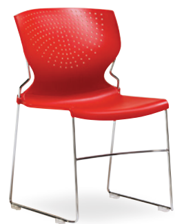
SD-15-CHR-REAL RED (2)