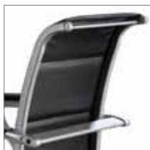
Shown with optional outside upholstered back