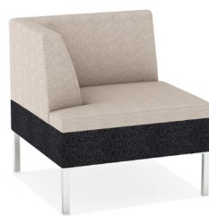
Right Arm - 7850R