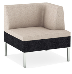
Left Arm - 7850L

Seat Dimensions: 27W x 27D x 28.5BH x 28.5AH x 17SH