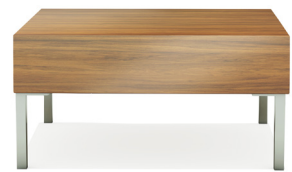
End Table- 7860S 27W x 27D x 14H