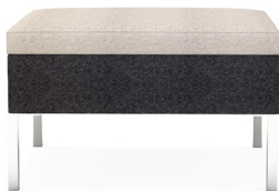
Backless- 7851 27W x 27D x 17H

Seat Dimensions: 27W x 27D x 28.5BH x 28.5AH x 17SH