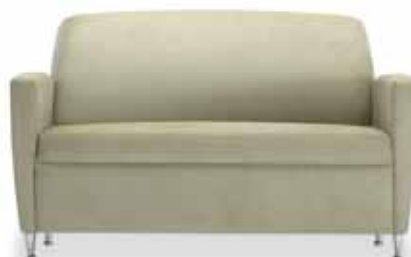
E3248 Loveseat OVERALL: W 56 D 30 H 34 SH 18 AH 25