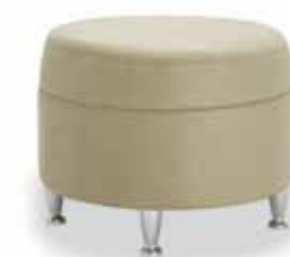
E3256 OVERALL: W 23 D 23 SH 18