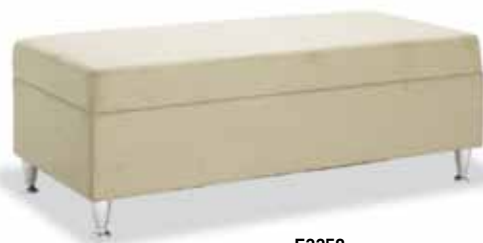
E3258 OVERALL: W 48 D 24 SH 18