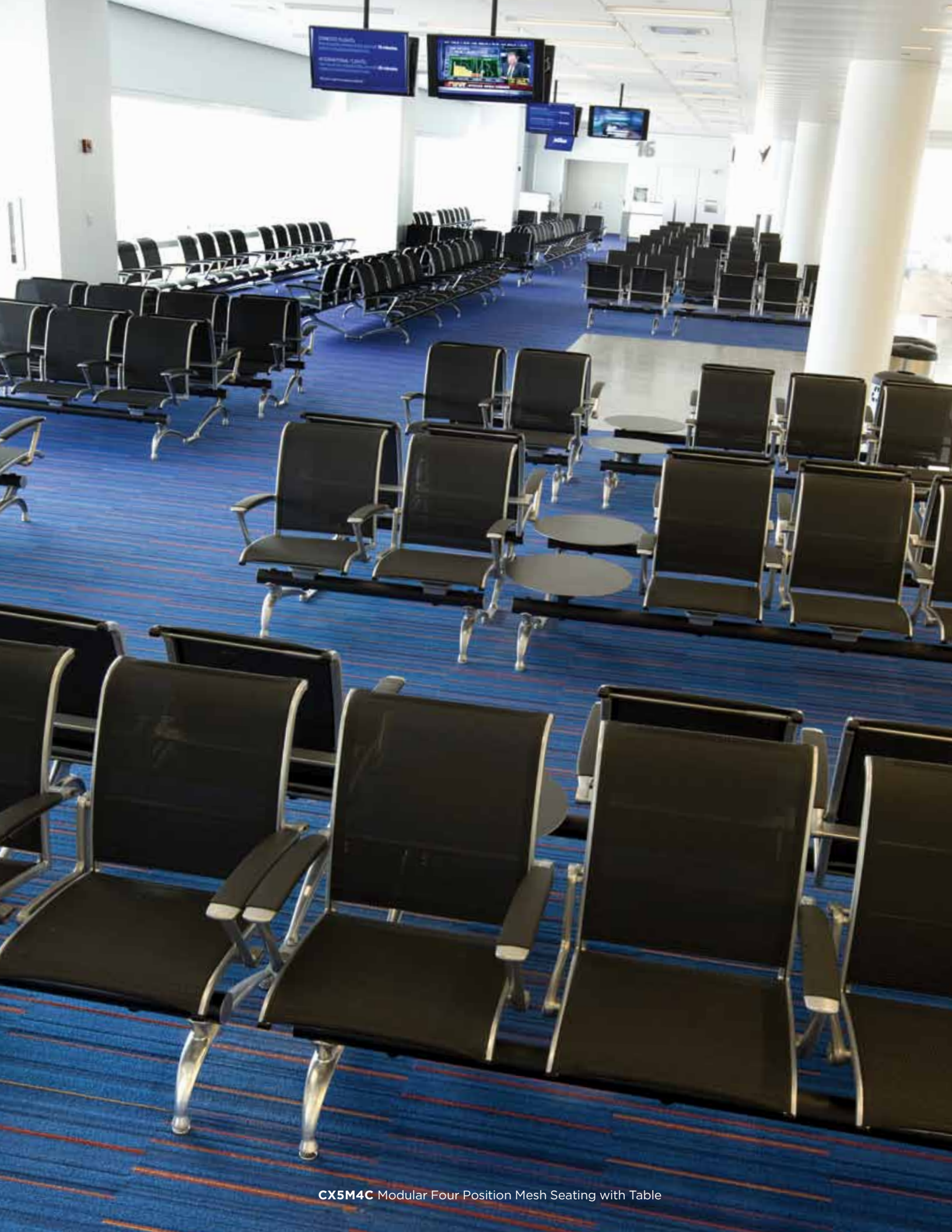
CX5M4C Modular Four Position Mesh Seating with Table