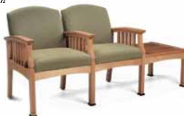
TABLE: 22 x 22 H 16½

Refer to Price List for Additional Variations