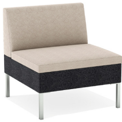
Straight Unit - 7852