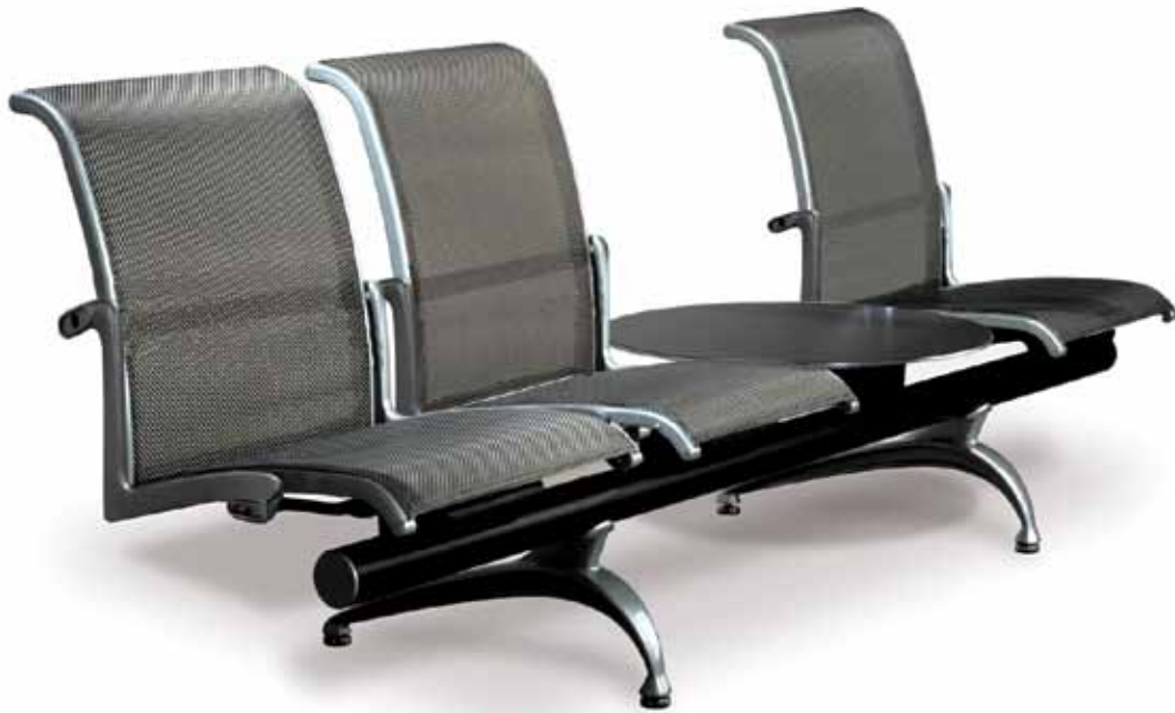
CX5M4C Modular Four Position Mesh Seating with Table