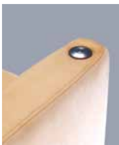
Tablet Pivot Insert