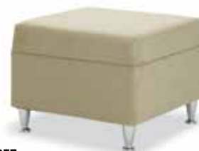
E3257 OVERALL: W 24 D 24 SH 18 E3259 OVERALL: W 42 D 42 SH 18