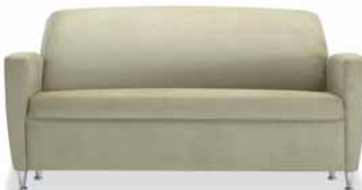
E3249 Sofa OVERALL: W 76 D 30 H 32.5 SH 18 AH 25

Refer to Price List for Additional Variations