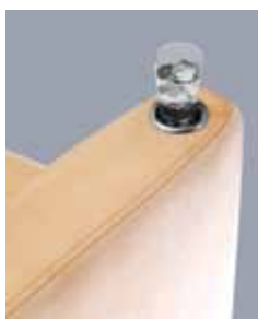
Optional Brushed Metal Insert Cup Holder