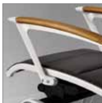
Optional beech wood arm cap