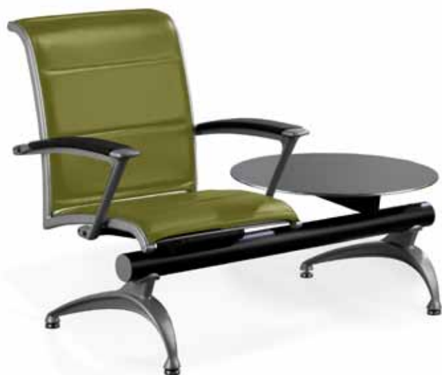
CX5U2B CX Modular Two Position Upholstered Seating with Fixed Arms and Table