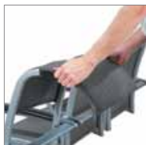
Seats and backs easily removed for cleaning or replacement