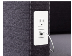
Minitap Power Unit w/USB