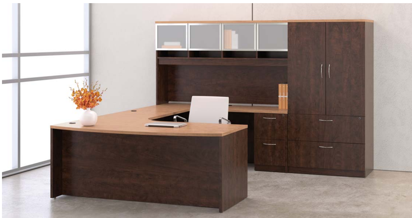
No other casegoods line offers the design flexibility of Convergence. You can even combine multiple laminate finishes to create a look that's all your own.