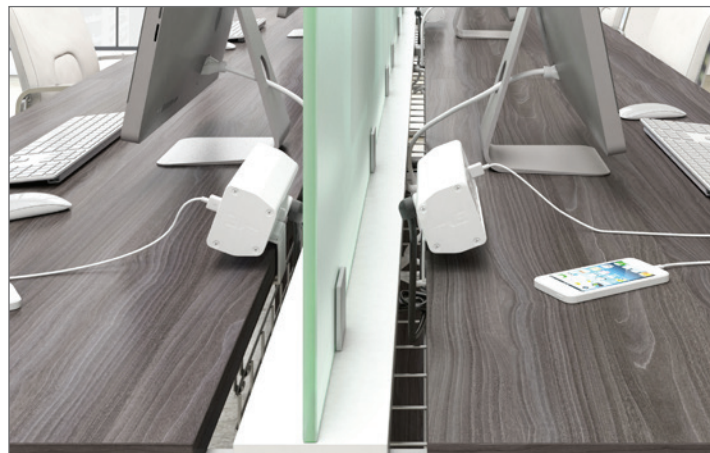
Power can easily be brought to the worksurface allowing users the option to plug in above or below the worksurface.