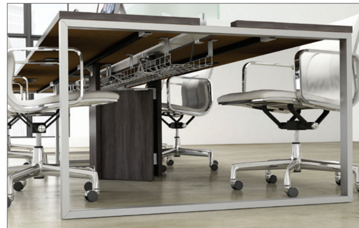
The wire basket can be easily disconnected in order to place power cords, power bricks, or other peripherals.