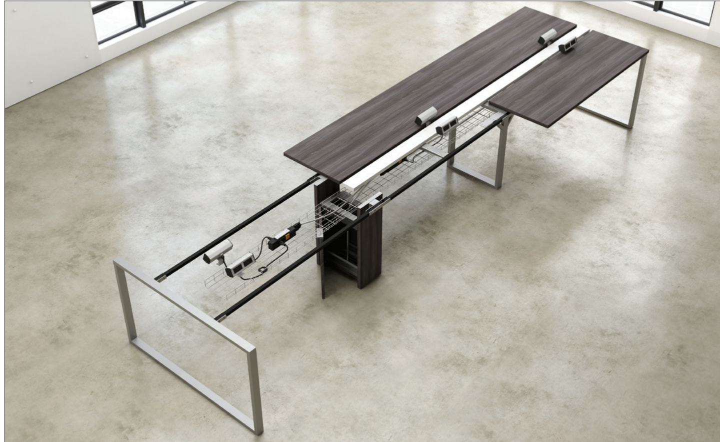
Steel beams running between the support legs give lateral strength to the bench while supporting the worksurfaces. Steel or laminate intermediate legs can be used to provide support for longer runs. The 8-wire, 4-circuit electrical can be placed in the wire basket under the worksurfaces.

Synapse offers multiple solutions for bringing power and data to workstations