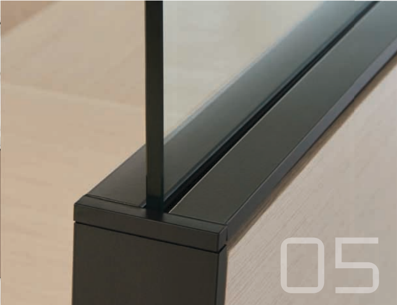
05 inset glass The Inset Glass blade is embedded in the panel to provide a clean design aesthetic and access to natural light.