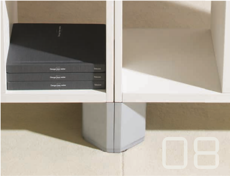
08 angled foot An angled foot option on storage units enables stand-alone spine applications. The foot offers a 3-inch adjustment range.