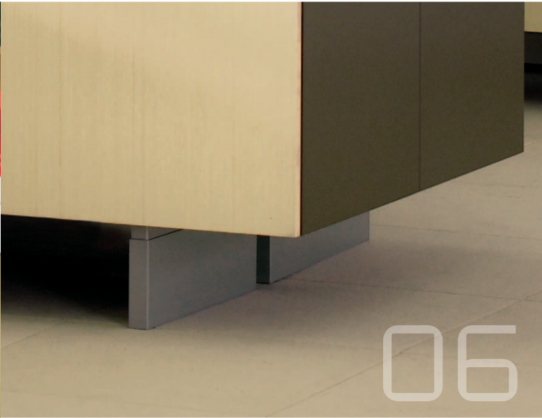
06 district foot The District foot on credenzas offers a 3-inch adjustment range. A level cover maintains a refined design aesthetic.