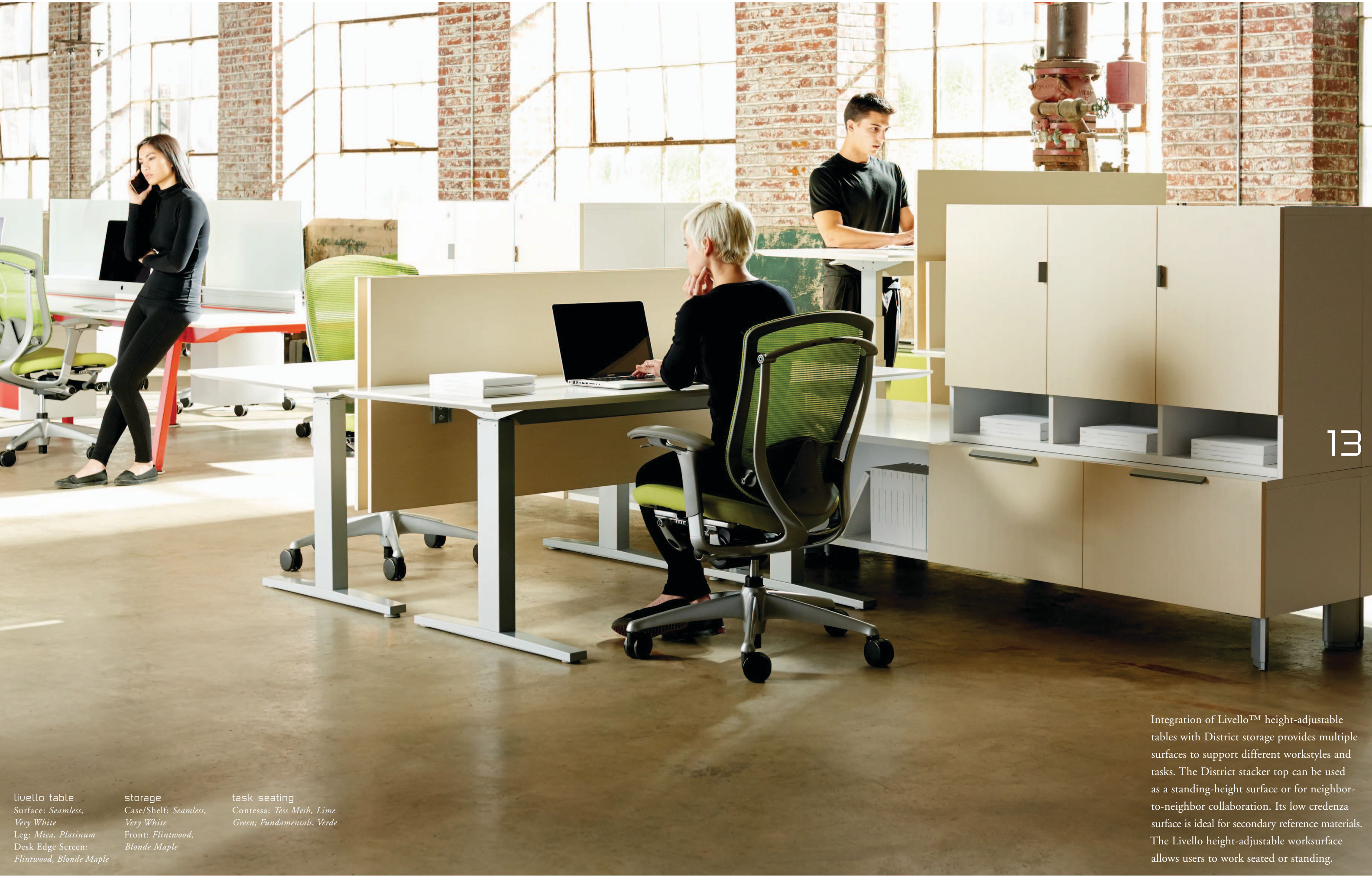
livello table storage task seating Surface: Seamless, Very White Case/Shelf: Seamless, Very White Contessa: Tess Mesh, Lime Green; Fundamentals, Verde Leg: Mica, Platinum Front: Flintwood, Blonde Maple Desk Edge Screen: Flintwood, Blonde Maple

Integration of Livello™ height-adjustable tables with District storage provides multiple surfaces to support different workstyles and tasks. The District stacker top can be used as a standing-height surface or for neighbor-to-neighbor collaboration. Its low credenza surface is ideal for secondary reference materials. The Livello height-adjustable worksurface allows users to work seated or standing.