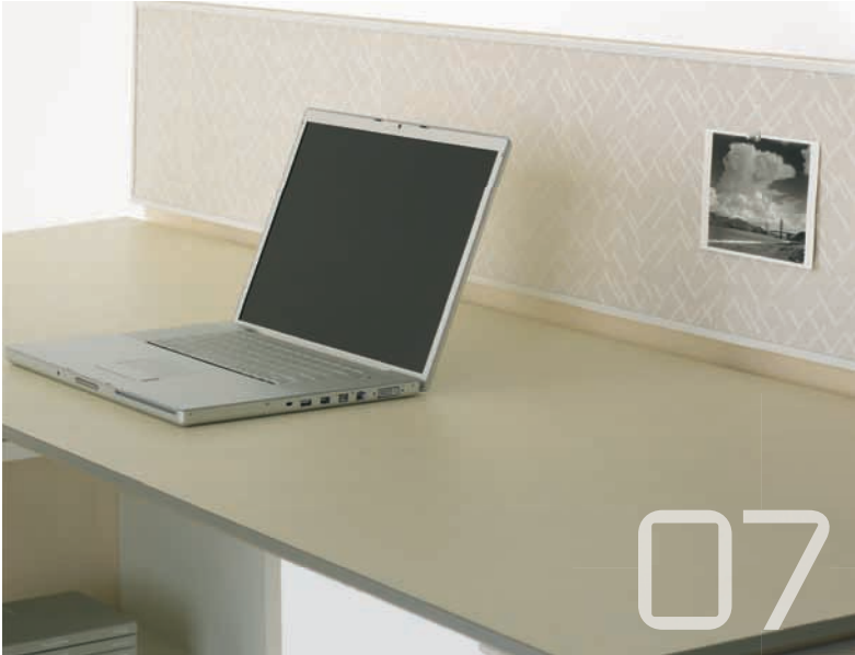
07 desk edge screen with tackboard Desk Edge Screens mount on- or off-module to the back or return edges of a worksurface to provide privacy. They can be used with a tackboard for added functionality.