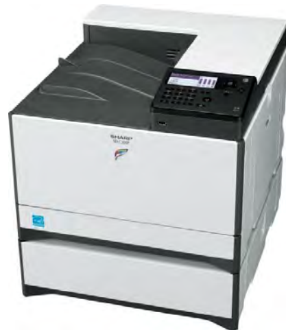
MX-C300P shown with optional accessories