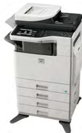
MX-B402SC shown fully configured with optional accessories