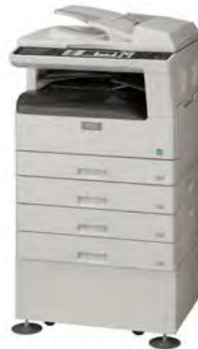
MX-M232D shown with optional accessories