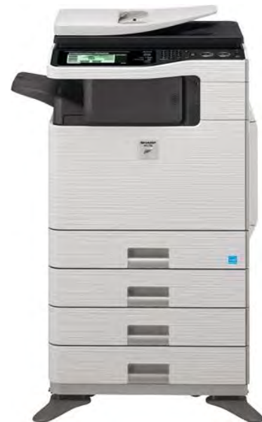
MX-C312 shown fully configured with optional accessories