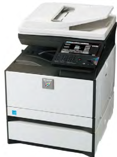
MX-C301W shown with optional accessories