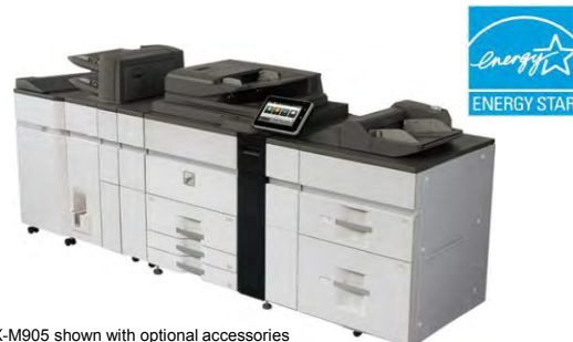
MX-M905 shown with optional accessories