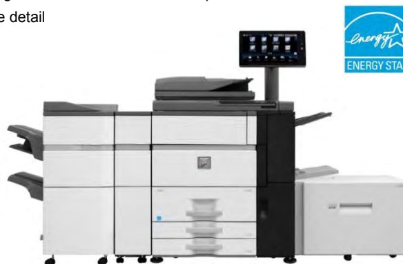
MX-6500N shown with optional accessories