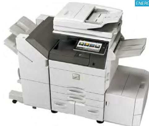
MX-6070N shown with optional accessories