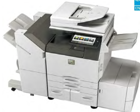
MX-3550N shown with optional accessories