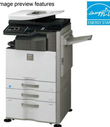
MX-3116N shown with optional accessories

* Some features require optional equipment