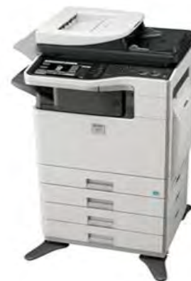
MX-C402SC shown fully configured with optional accessories