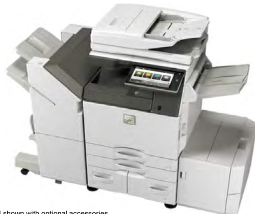
MX-4070N shown with optional accessories