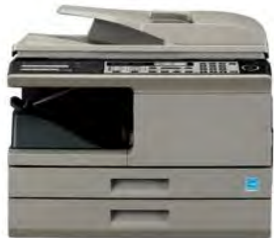
MX-B201D shown with optional accessories