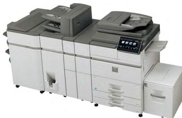
MX-M754N shown with optional accessories