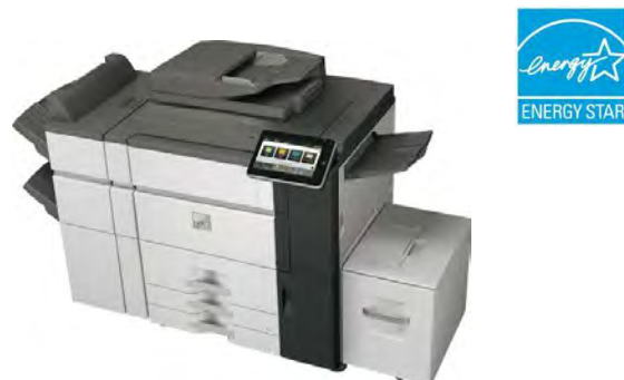
MX-7580N shown with optional accessories