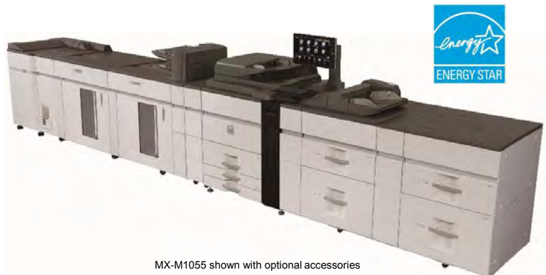
MX-M1055 shown with optional accessories