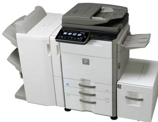
MX-M565N shown with optional accessories