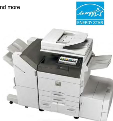
MX-5050N shown with optional accessories