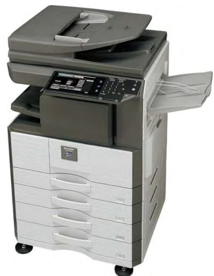
MX-M316N shown with optional accessories