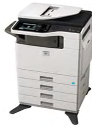
MX-B402 shown fully configured with optional accessories