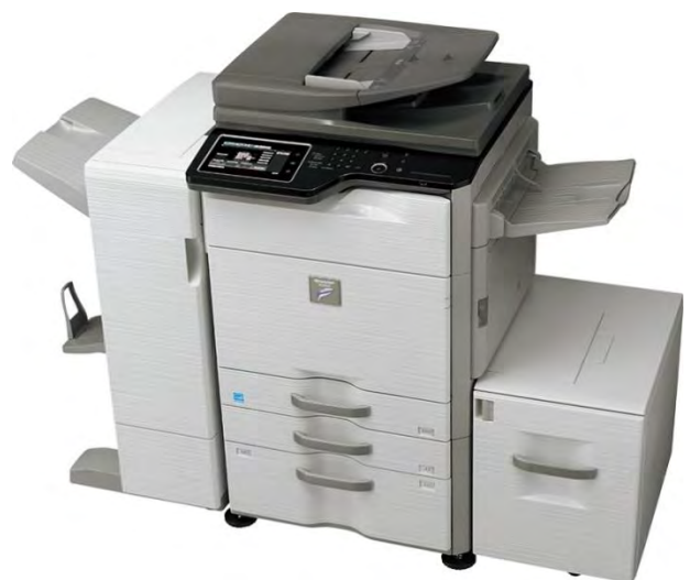
MX-M564N shown with optional accessories