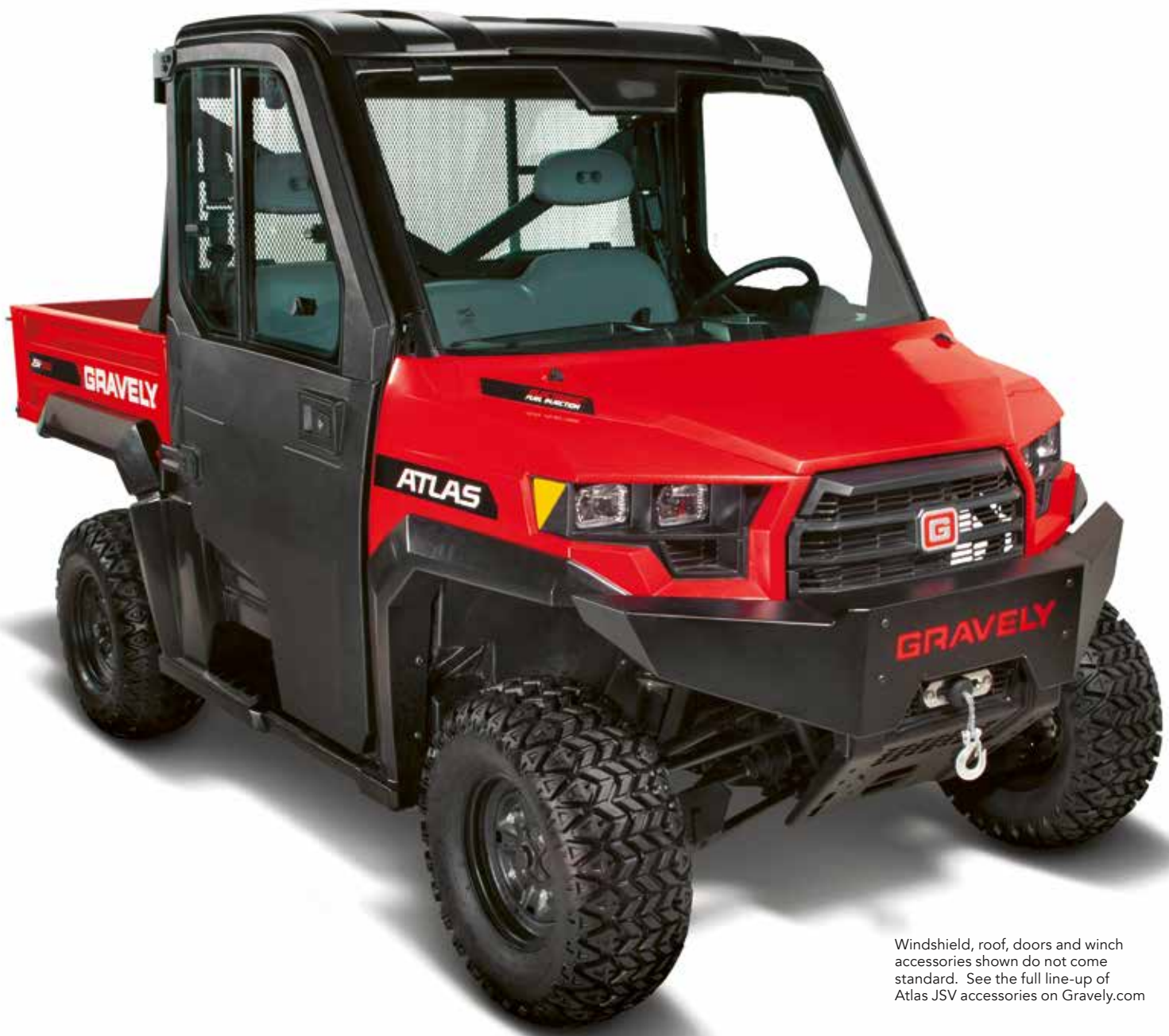
Windshield, roof, doors and winch accessories shown do not come standard. See the full line-up of Atlas JSV accessories on Gravelly.com