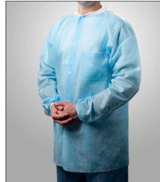
◀ Mid-Length Style

Tronex latex-free disposable lab coats and jackets are constructed of durable, breathable, fluid-resistant nonwoven spunbond or multilayer nonwoven spunbond materials, providing excellent overall protection.