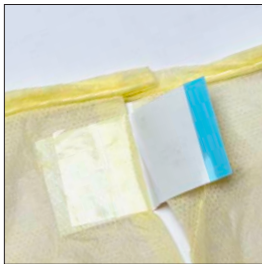
▲ Tape-Tab Neck Closure