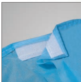
Hook-and-Loop Neck Closure ►