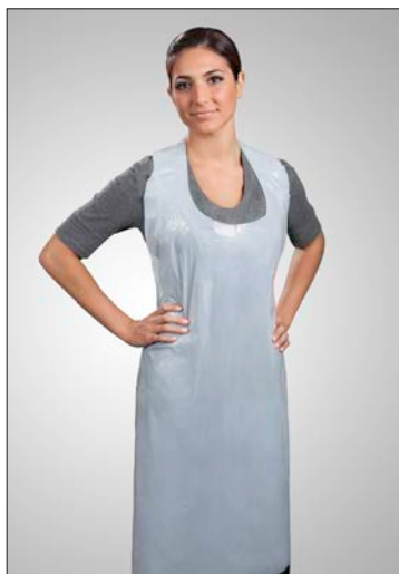
◀ Poly Apron

Our fluid-impervious, latex-free poly aprons are fashioned in a bib style with waist ties for a universal fit, providing superior protection and comfort for various applications.