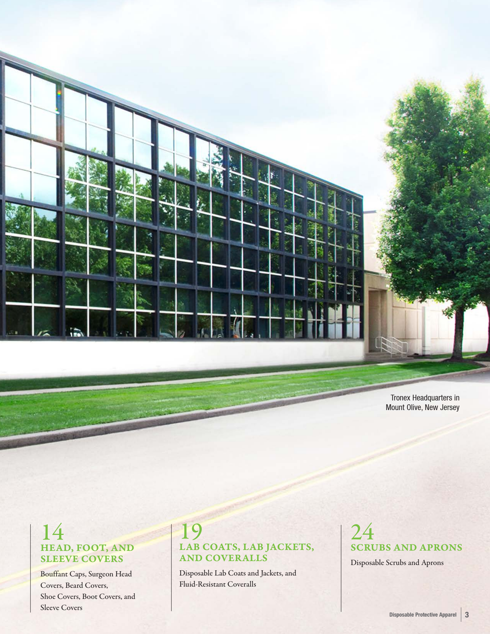
Tronex Headquarters in Mount Olive, New Jersey